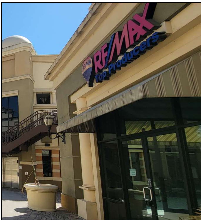
Suite 137-167 (2,945 SF)