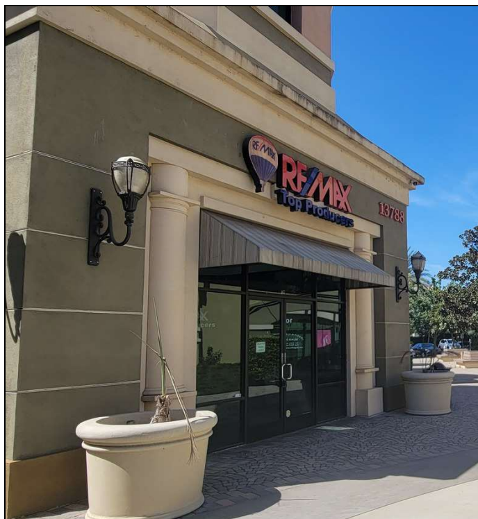
Suite 137-167 (2,945 SF)