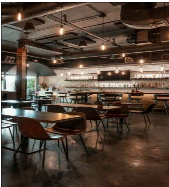
Suite 176-186 (2,455 SF Restaurant)