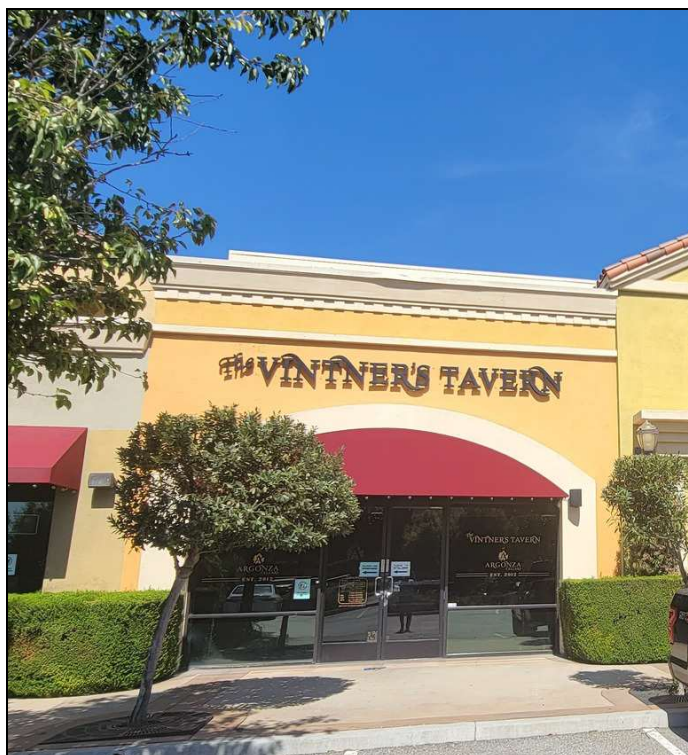
Suite 176-186 (2,455 SF Restaurant)