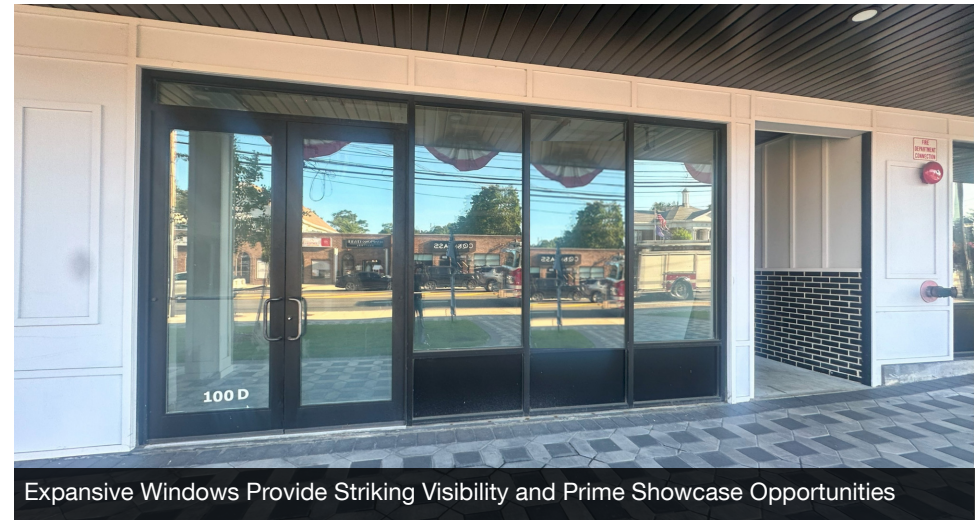
Expansive Windows Provide Striking Visibility and Prime Showcase Opportunities