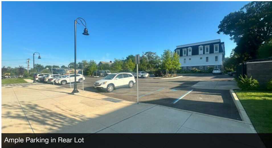
Ample Parking in Rear Lot