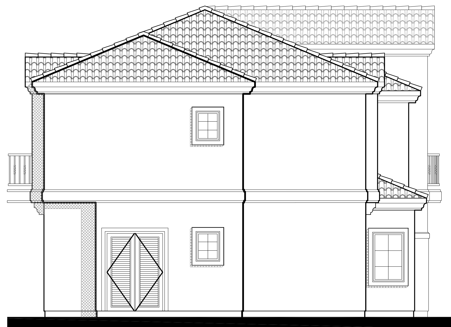
PROPOSED SOUTH ELEV - BLD'G "1"