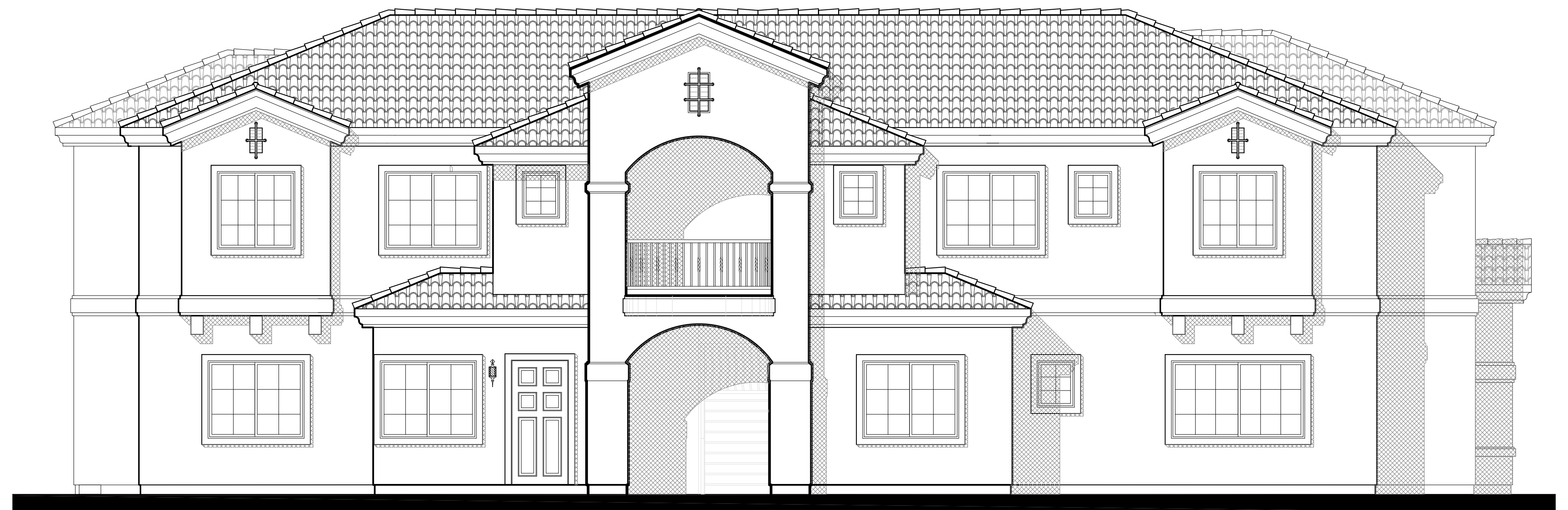
PROPOSED EAST ELEVATION - BLD'G "1"