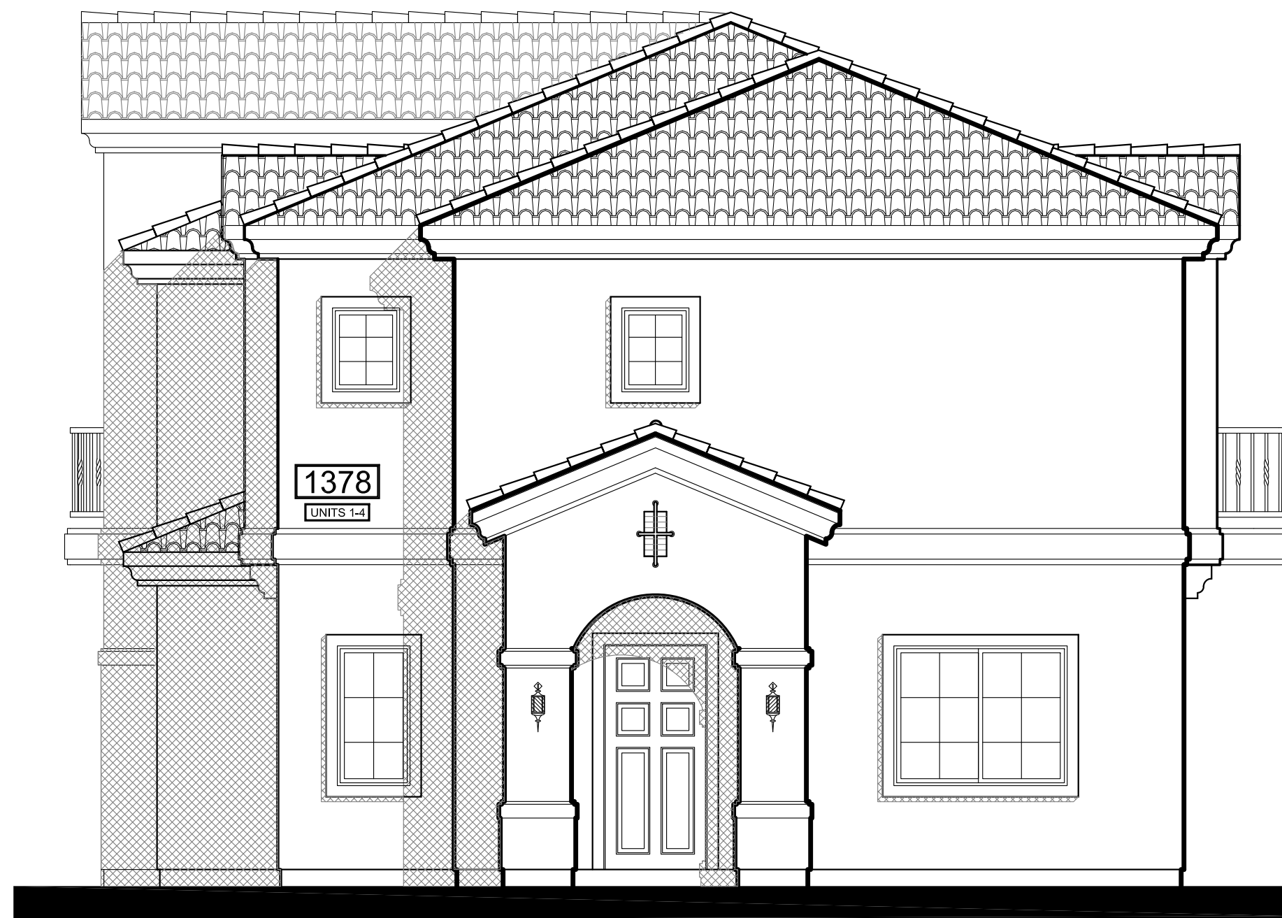
PROPOSED NORTH ELEV - BLD'G "1"