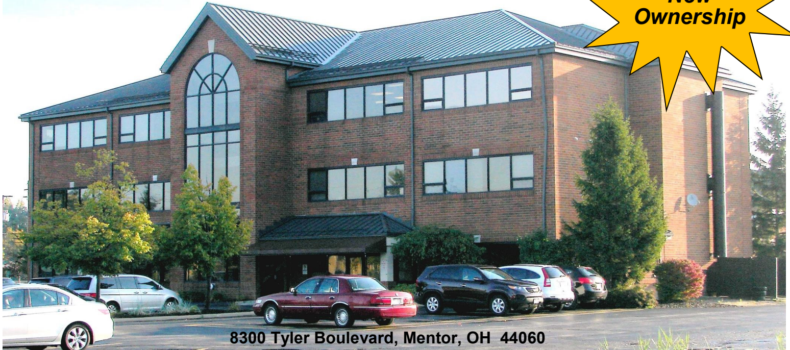
8300 Tyler Boulevard, Mentor, OH 44060