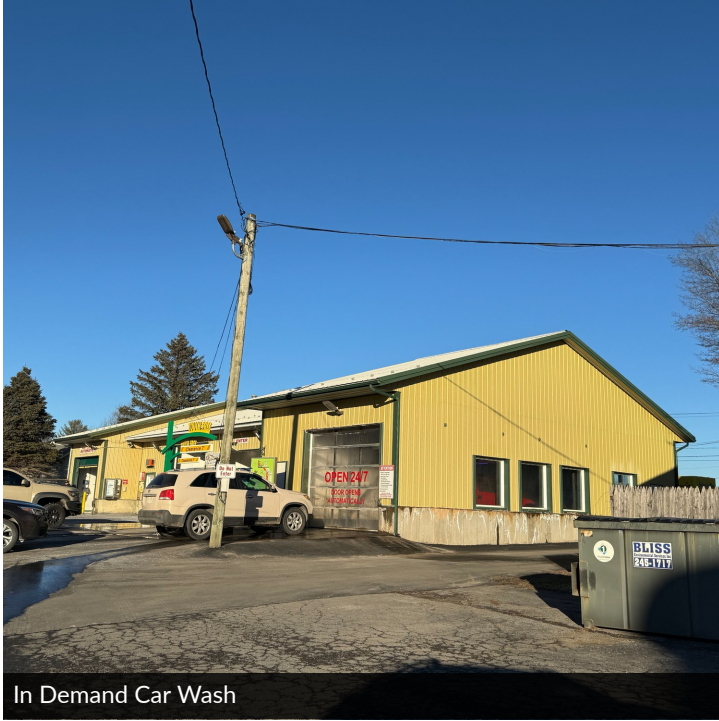
In Demand Car Wash