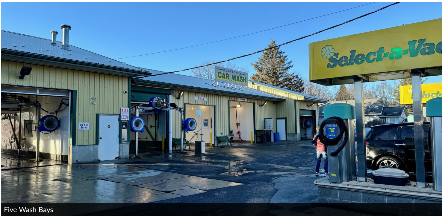
Five Wash Bays

TOM LISCHAK, CCIM 315.430.0443 tom@c21bridgeway.com