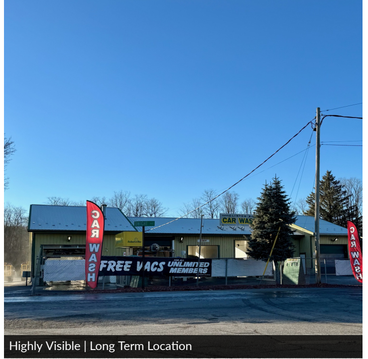
Highly Visible | Long Term Location