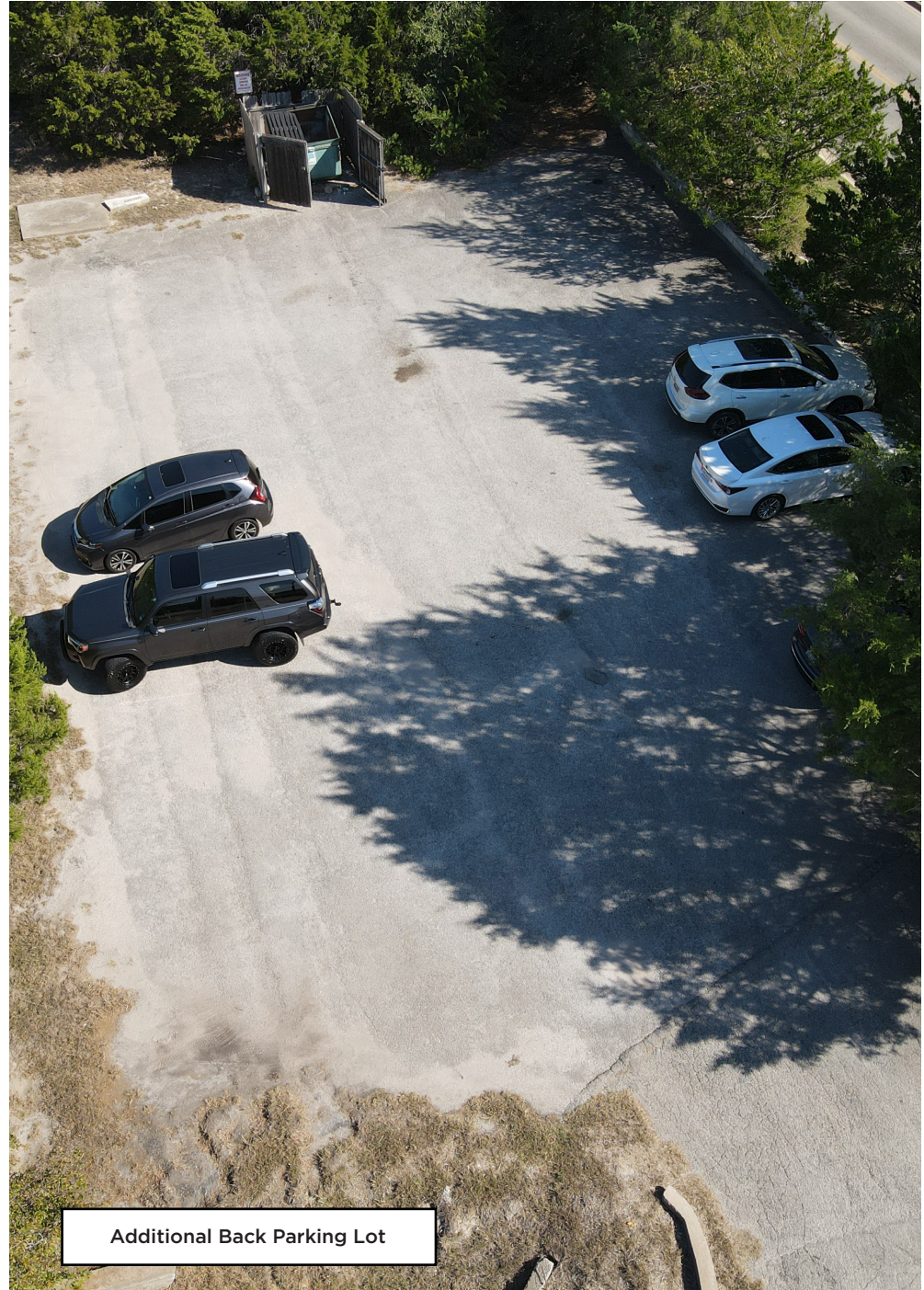
Additional Back Parking Lot