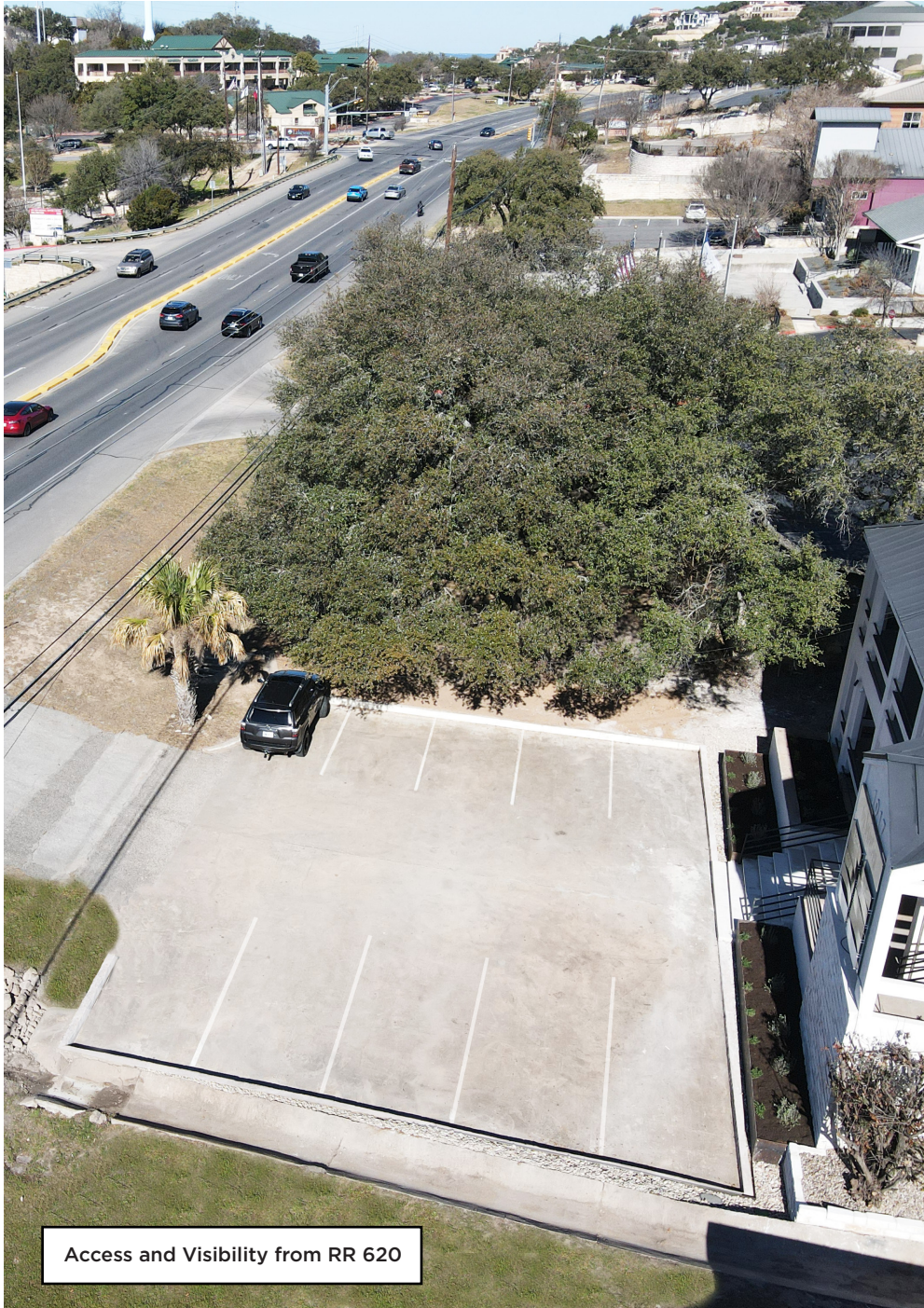
Access and Visibility from RR 620