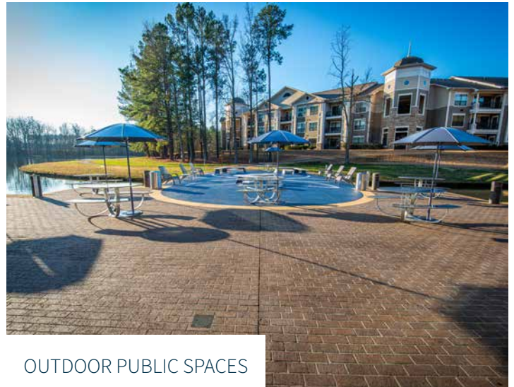
OUTDOOR PUBLIC SPACES