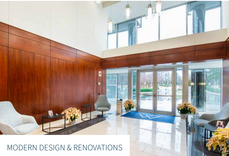
MODERN DESIGN & RENOVATIONS