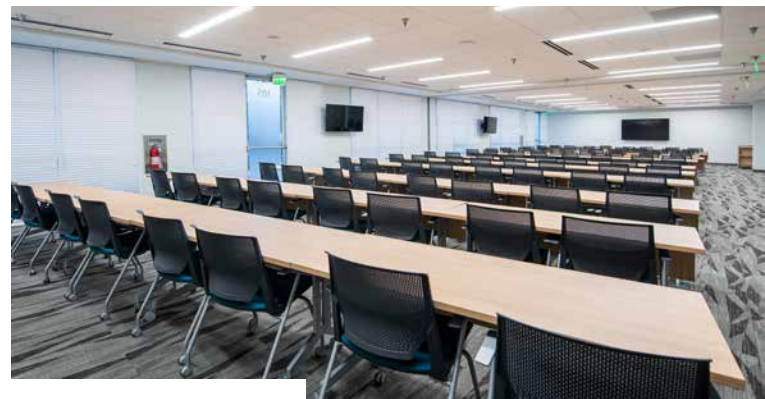
TENANT LOUNGE AND SHARED CONFERENCING