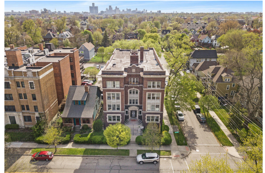
Minutes from Downtown Detroit