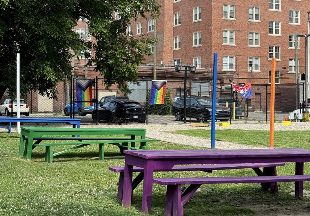
Nearby Biergarten / Dog Park