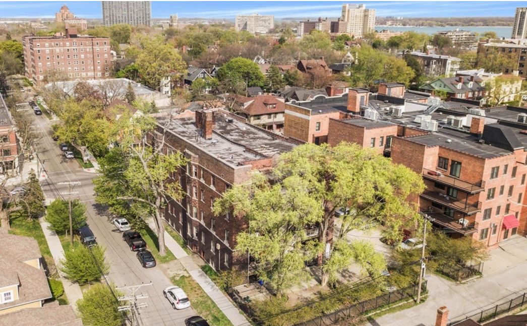
Back view of Building