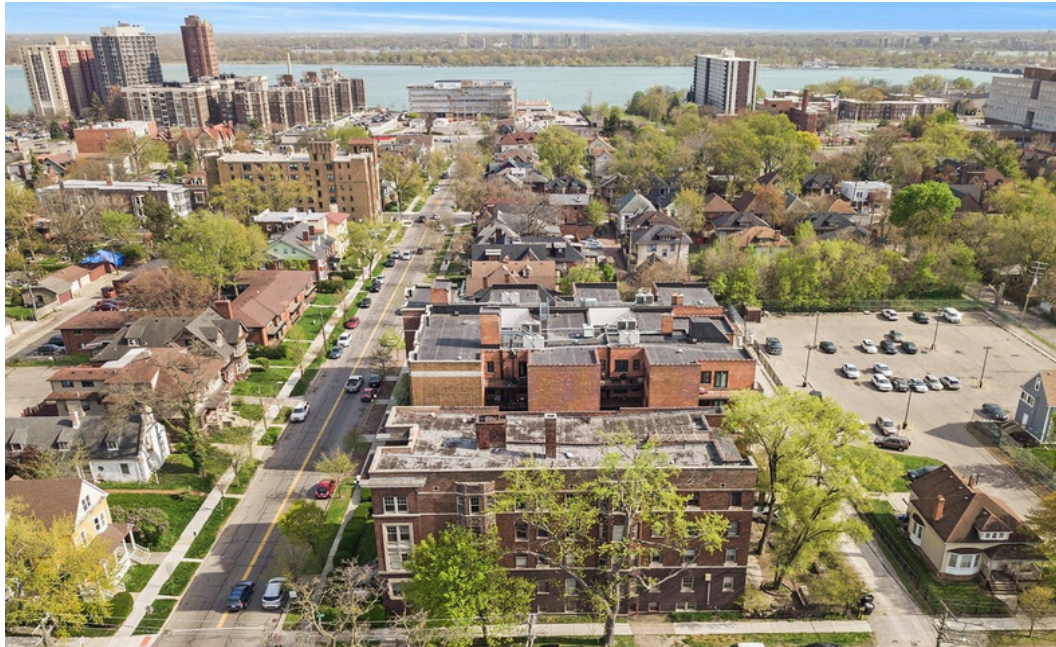
Side view of Building