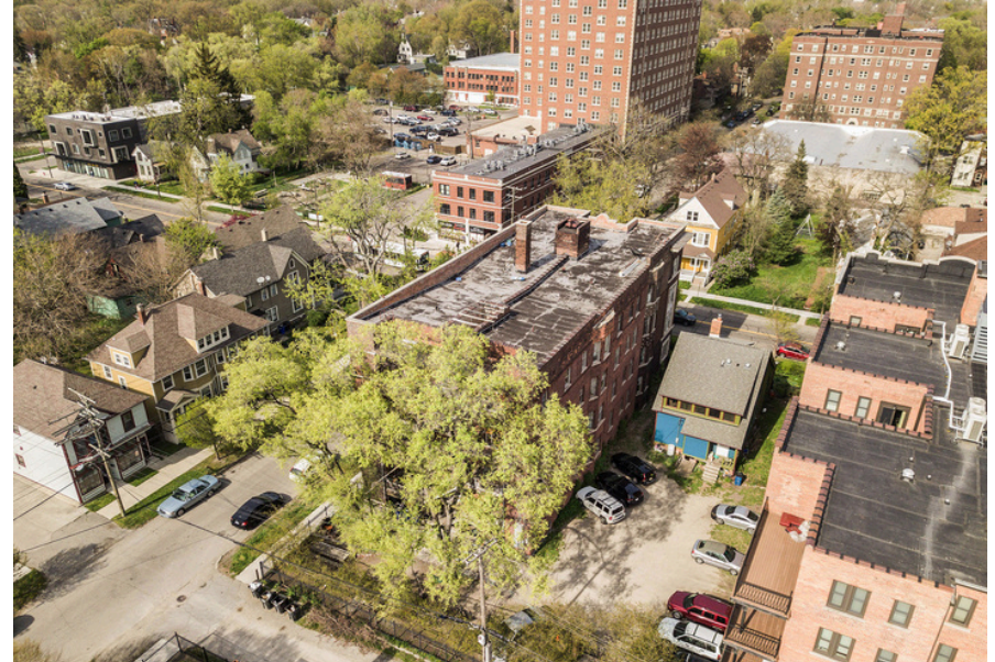
12 - 15 Parking Spaces in Gated Parking Lot