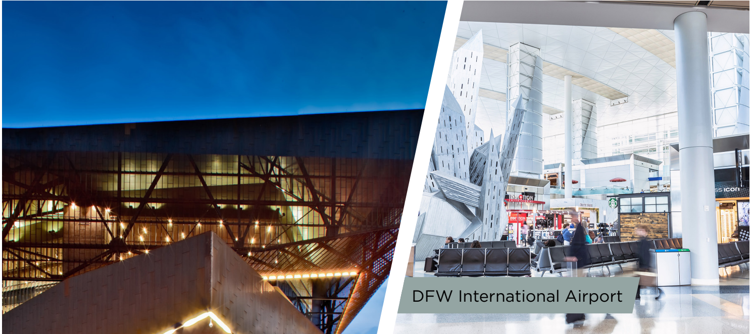
Irving Convention Center