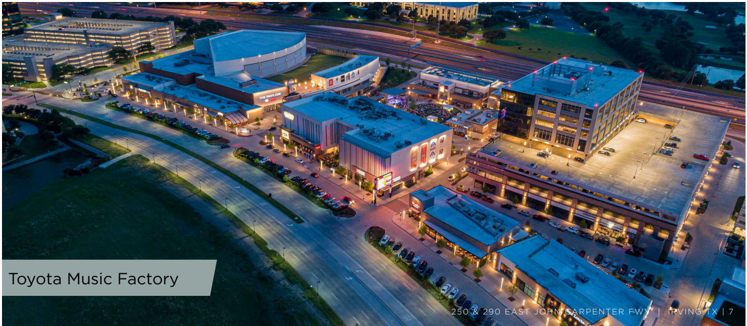
Toyota Music Factory

Passengers travel through Dallas airports daily due to high accessibility and central location