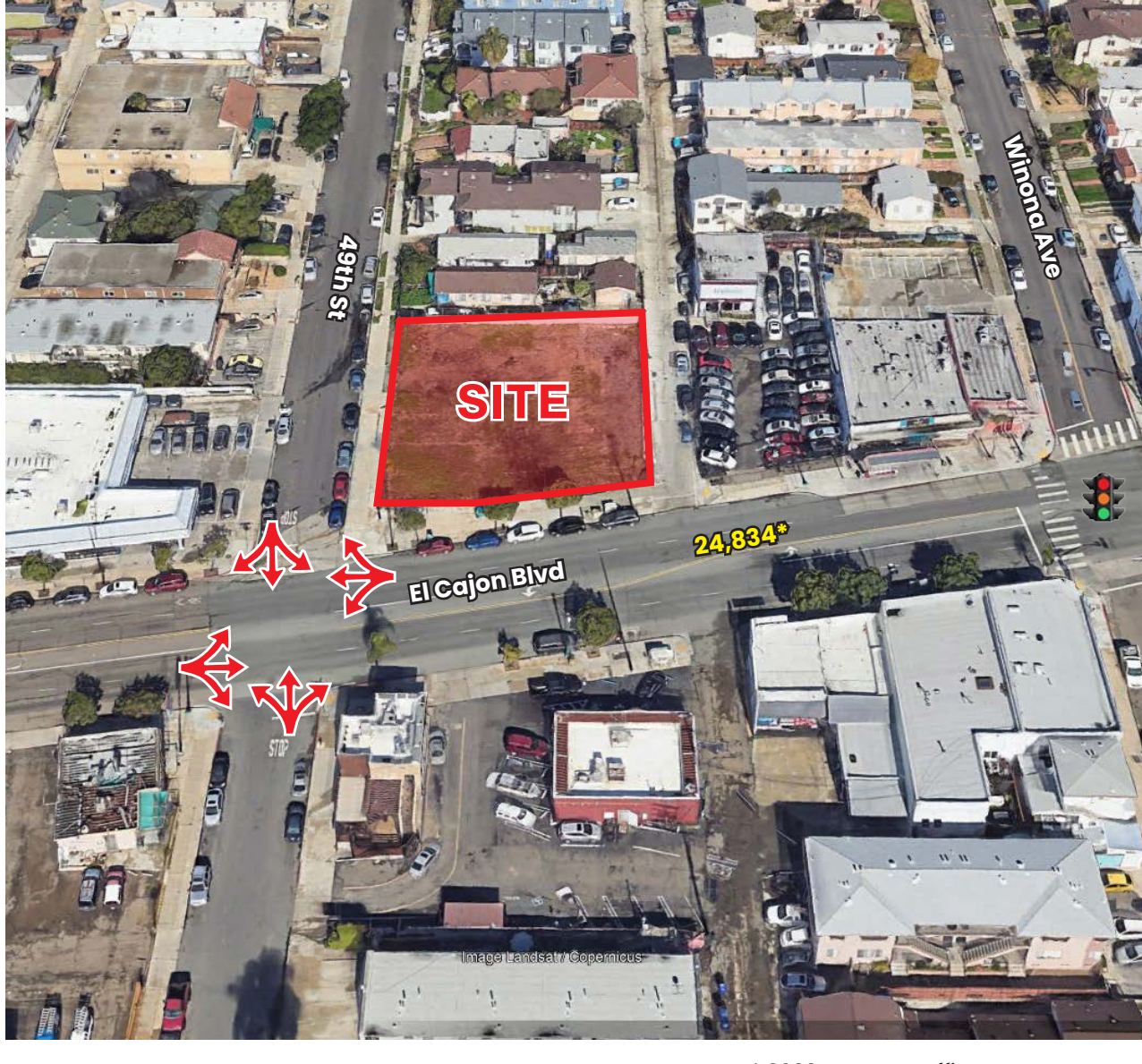
* 2022 CoStar Traffic Count