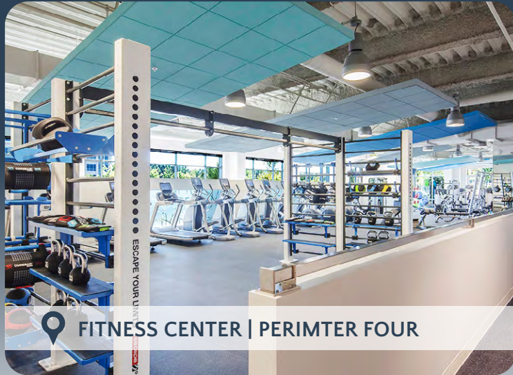
📍 FITNESS CENTER | PERIMETER FOUR