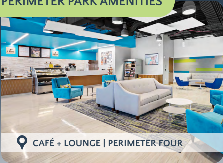
📍 CAFÉ + LOUNGE | PERIMETER FOUR