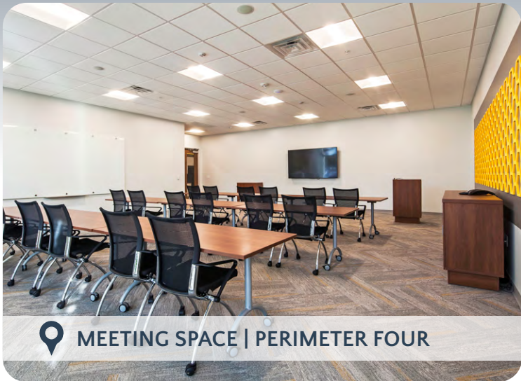
📍 MEETING SPACE | PERIMETER FOUR