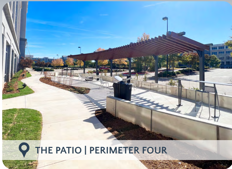
📍 THE PATIO | PERIMETER FOUR