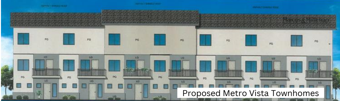
Proposed Metro Vista Townhomes

Opportunity zone with the potential for surrounding area to redevelop quickly. Less than 6 miles to Sky Harbor International Airport.