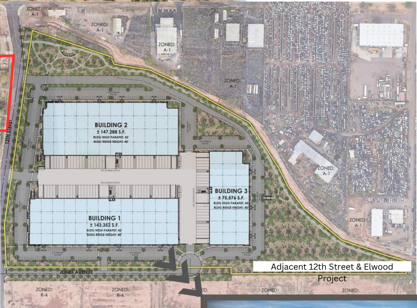
Adjacent 12th Street & Elwood Project

Opportunity zone with the potential for surrounding area to redevelop quickly. Less than 6 miles to Sky Harbor International Airport.