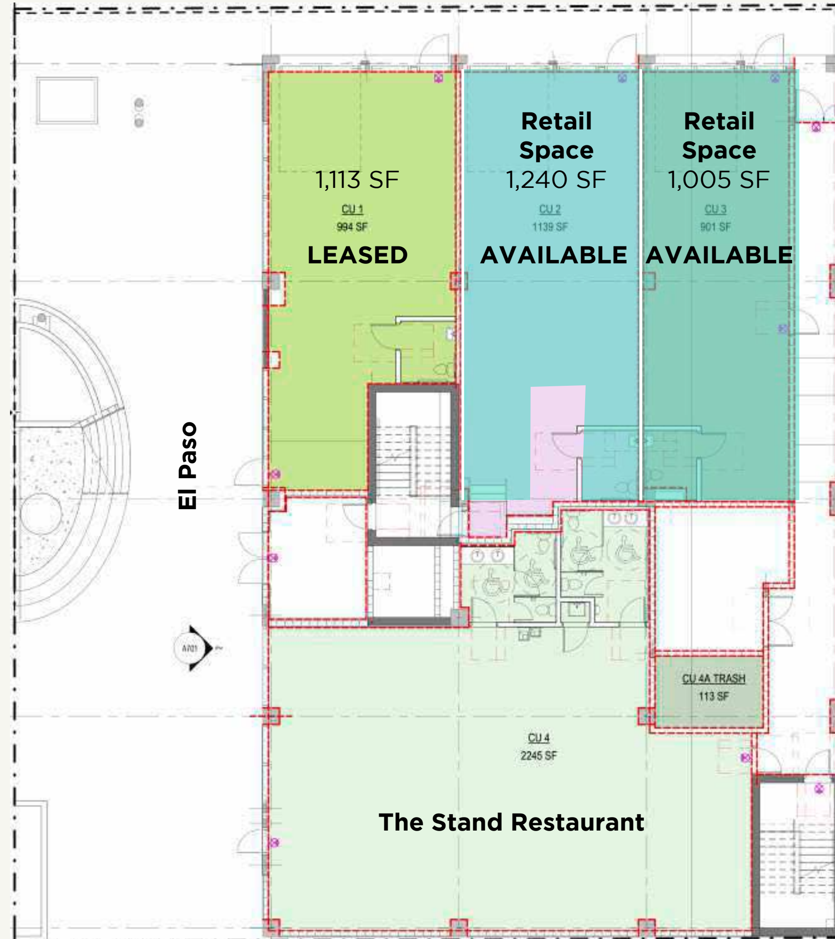
GROUND LEVEL Retail Rental Rate: $75 PSF NNN