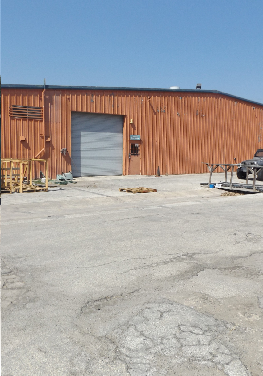
4654 Rigsby | San Antonio | TX 78222