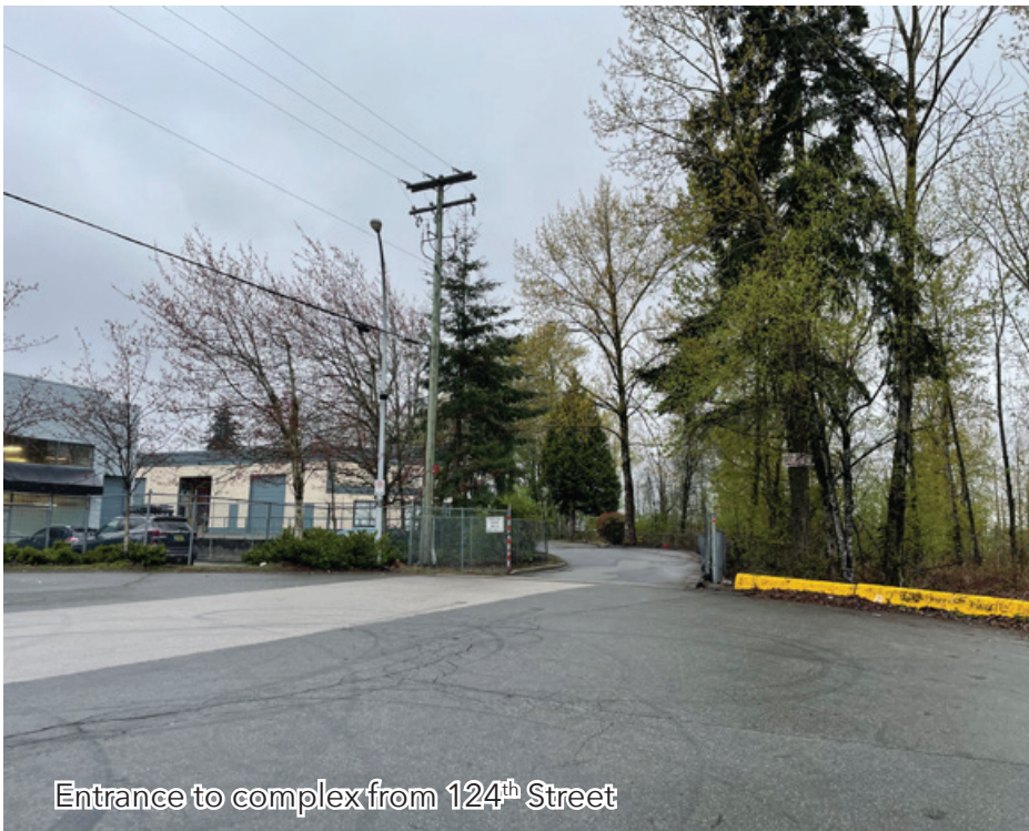
Entrance to complex from 124 th Street