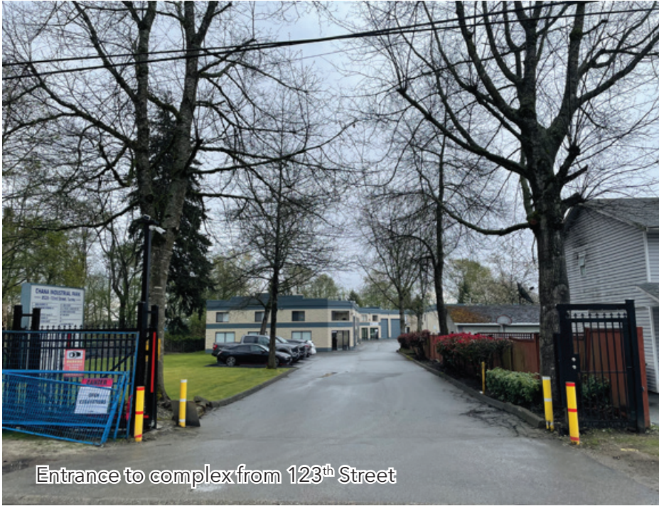
Entrance to complex from 123 th Street

FOR SALE OR LEASE | INDUSTRIAL #24-25 - 8528 123RD STREET SURREY, BC