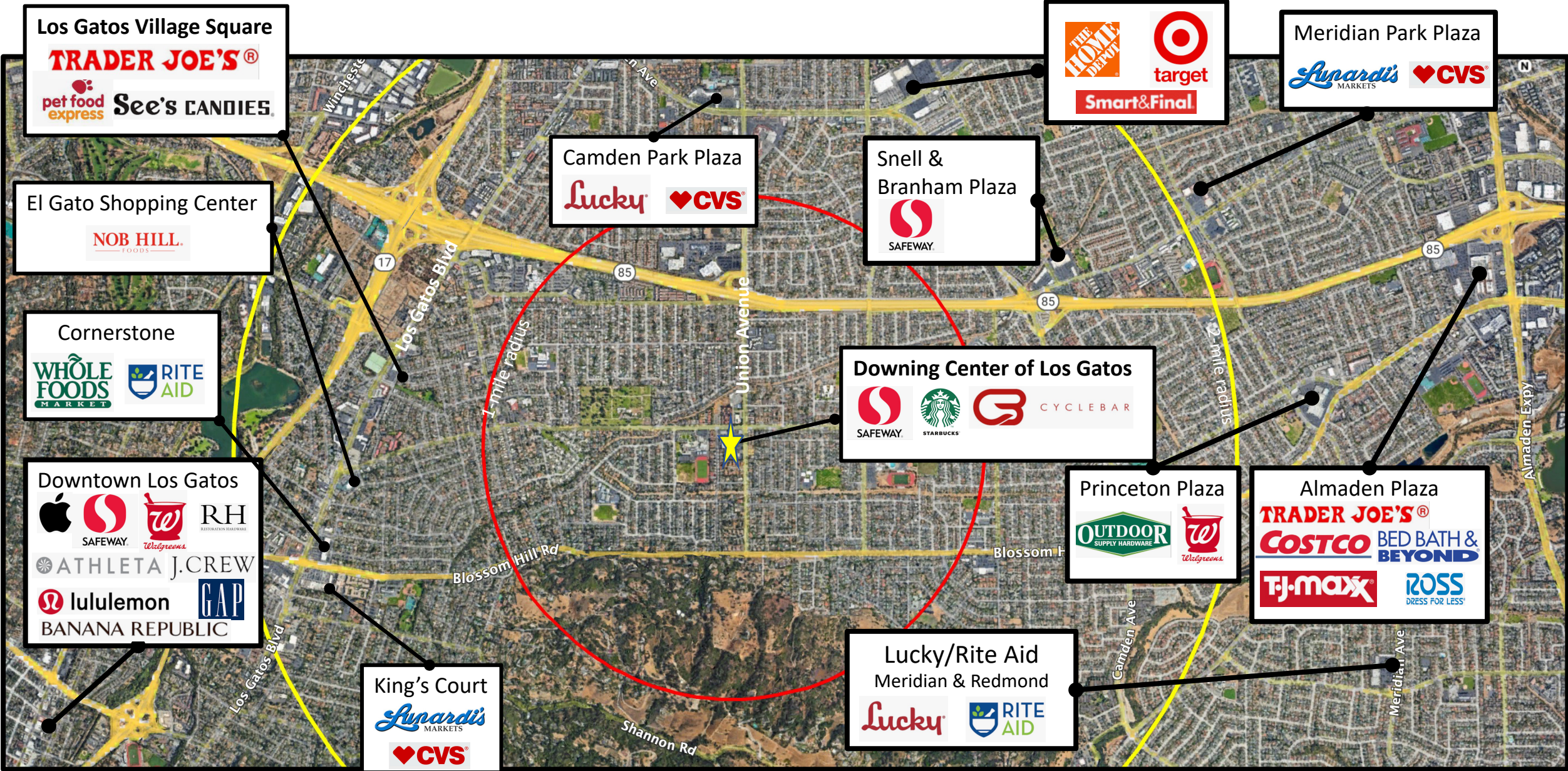
Downing Center Market Aerial