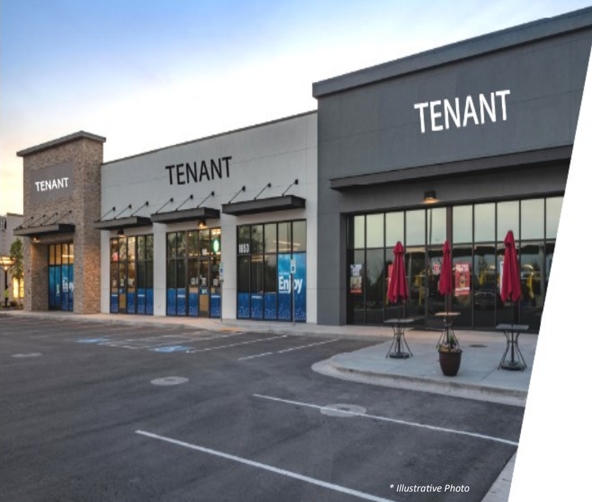
* Illustrative Photo