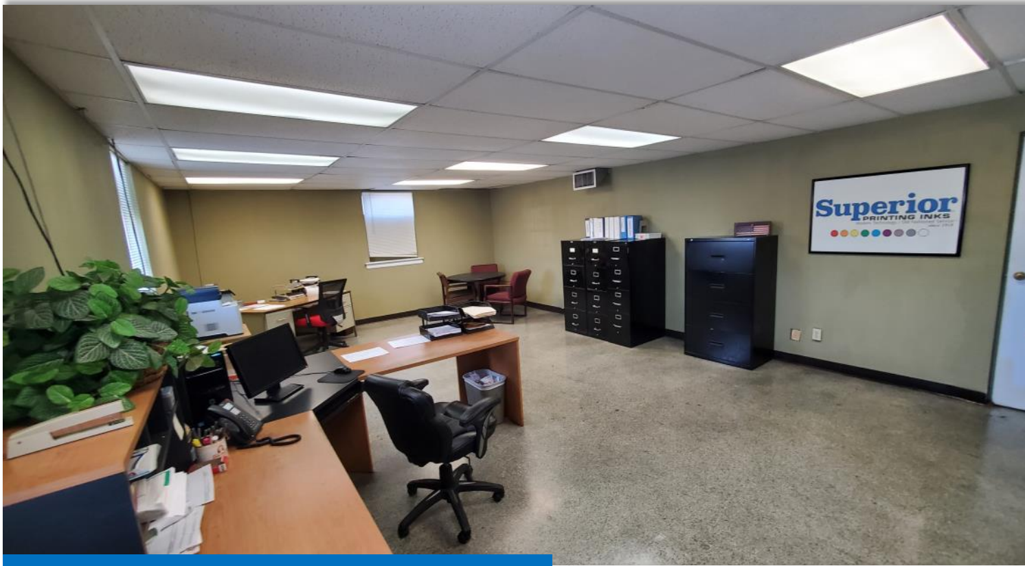
Executive offices at front of building (~1,000 SF)