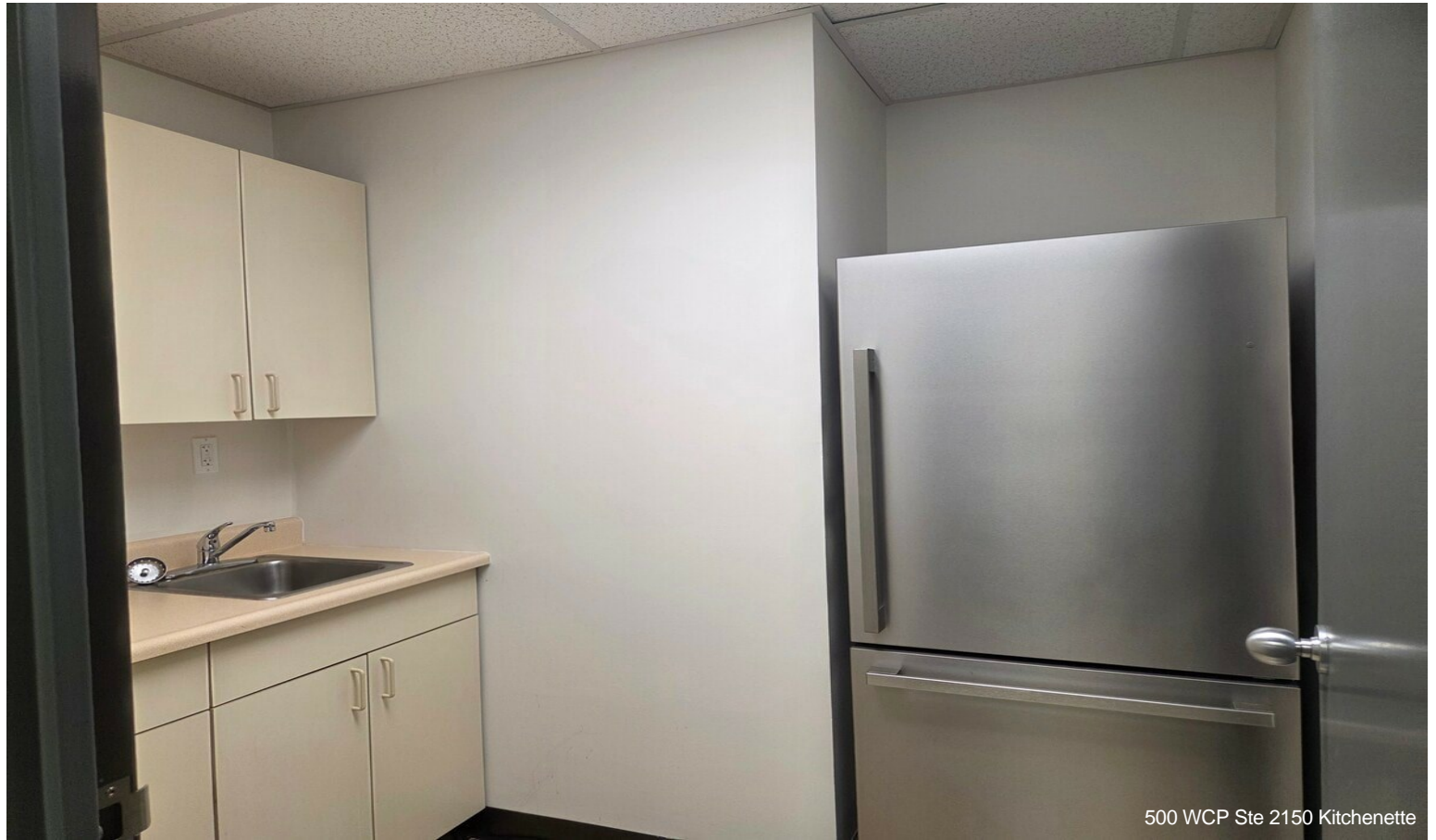
500 WCP Ste 2150 Kitchenette