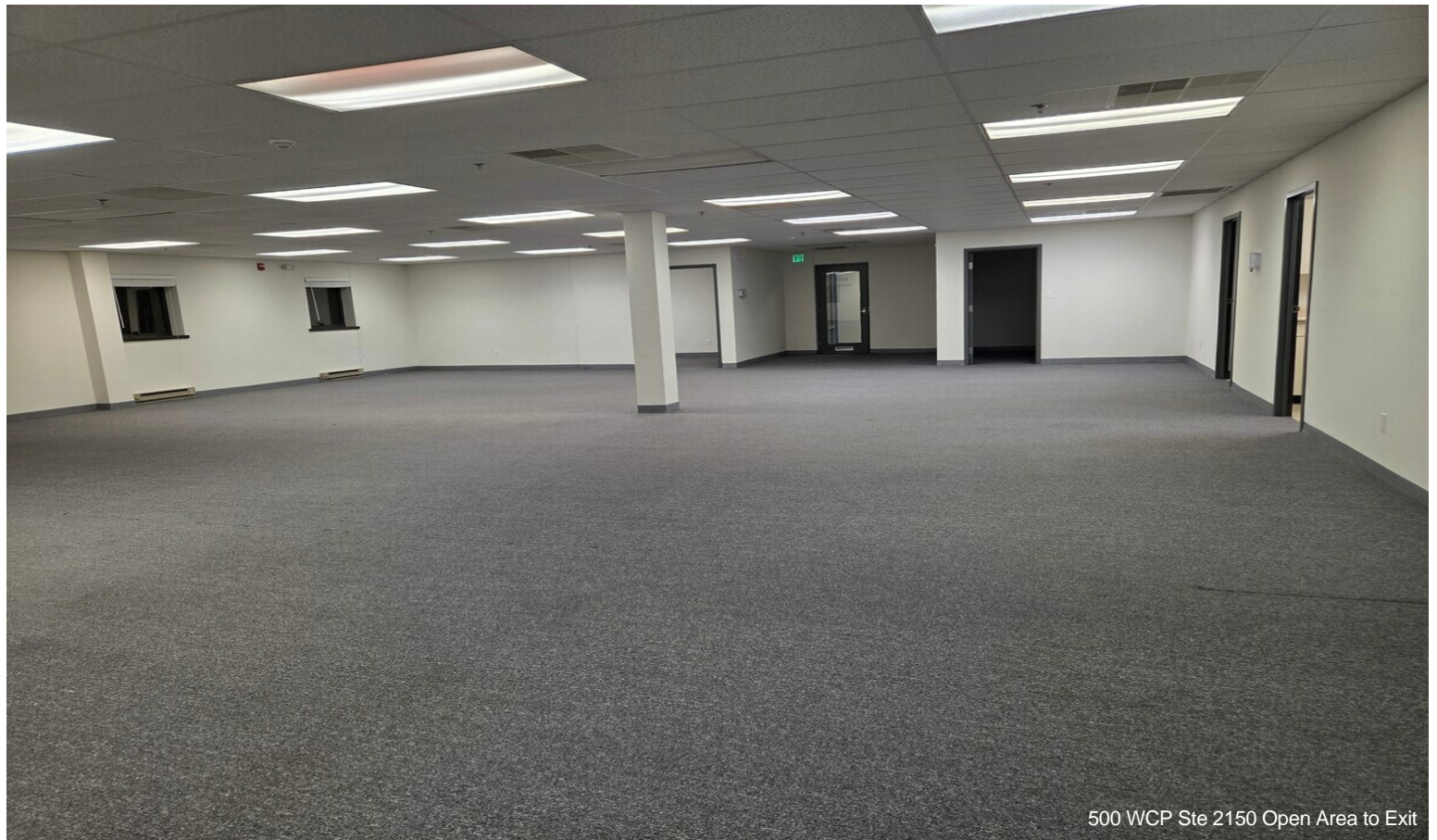
500 WCP Ste 2150 Open Area to Exit