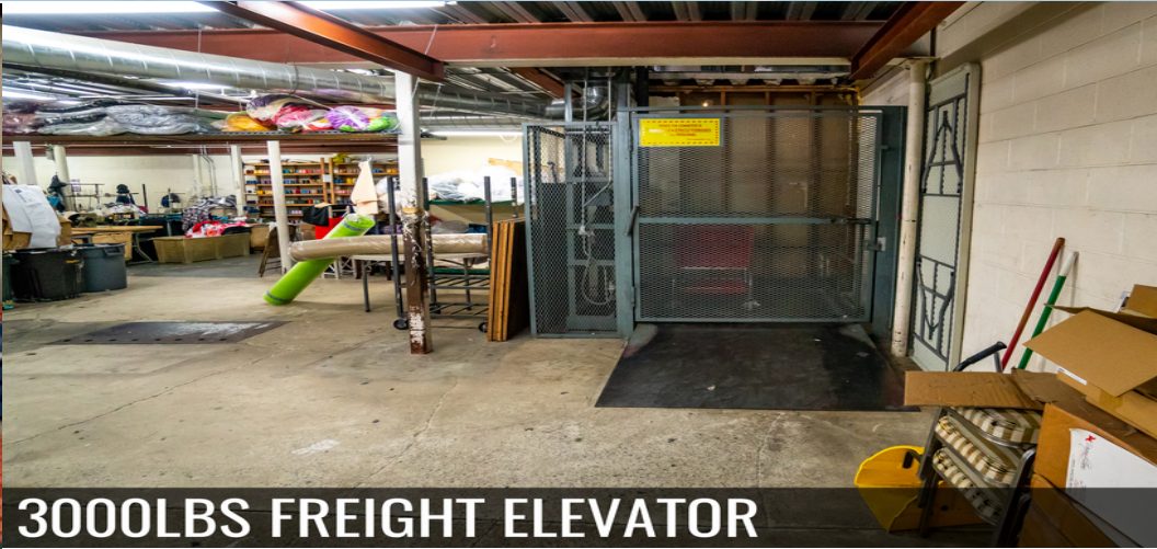
3000LBS FREIGHT ELEVATOR