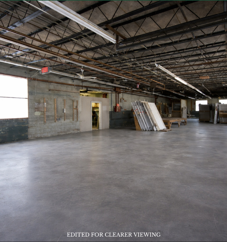
EDITED FOR CLEARER VIEWING