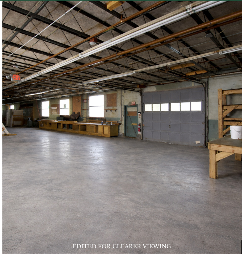
EDITED FOR CLEARER VIEWING