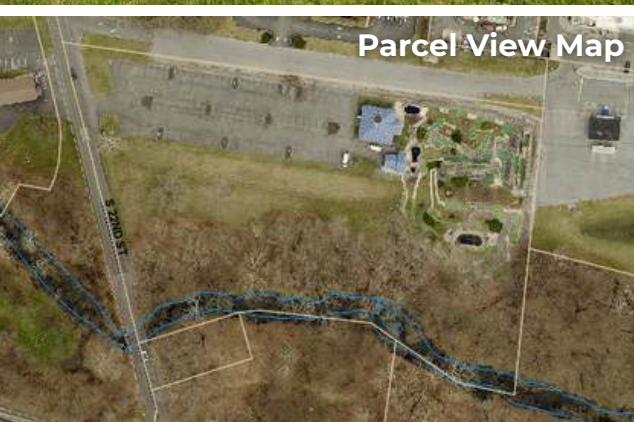
Parcel View Map