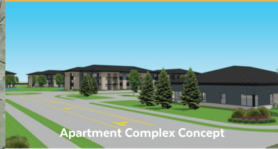
Apartment Complex Concept