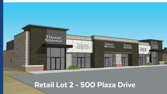
Retail Lot 2 - 500 Plaza Drive

481 Meridian Road | Glen Carbon, Illinois 62304 (NE Corner IL Rt 157 and Meridian Road)