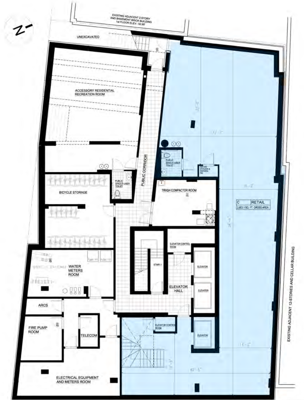
CELLAR FLOOR PLAN