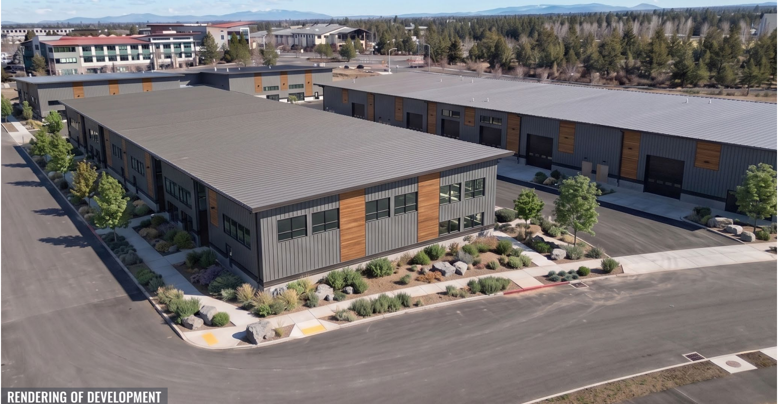
RENDERING OF DEVELOPMENT

NEW CONSTRUCTION | HIGH QUALITY BEND INDUSTRIAL