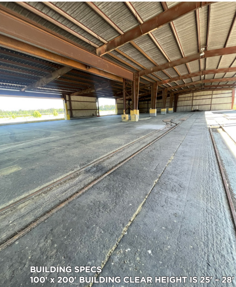
BUILDING SPECS 100' x 200' BUILDING CLEAR HEIGHT IS 25' - 28'