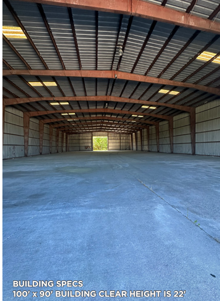
BUILDING SPECS 100' x 90' BUILDING CLEAR HEIGHT IS 22'