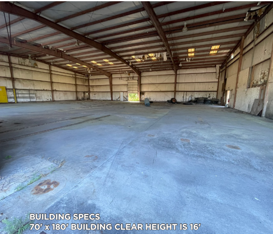
BUILDING SPECS 70' x 180' BUILDING CLEAR HEIGHT IS 16'