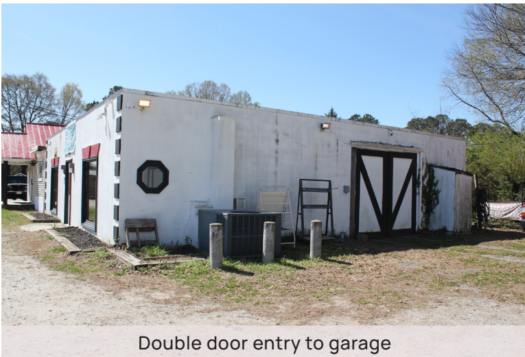
Double door entry to garage