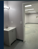
Office & Restroom Interior