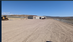
Property Lot & Yard