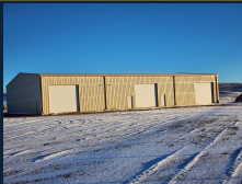
Building Exterior — South Side