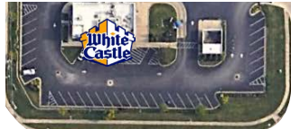
HIGHLAND POINTE DR