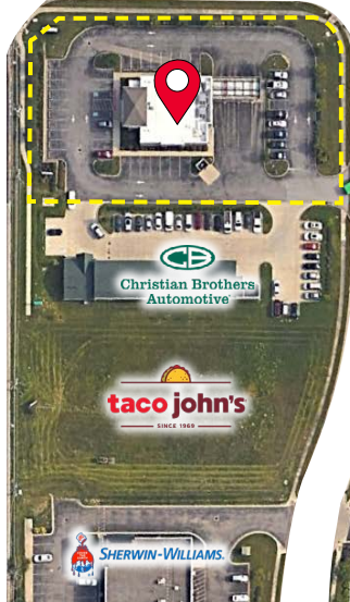
HIGHLAND POINTE DR