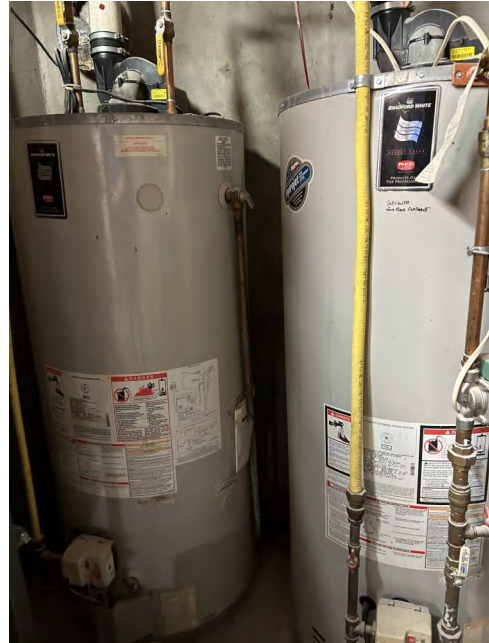
Two 75-Gal Bradford White Electric Hot Water Heaters