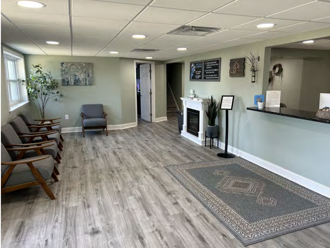
Reception and Waiting Room