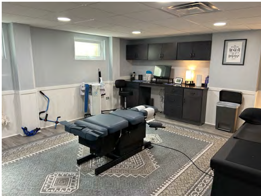
Exam Room / Office (typ.)