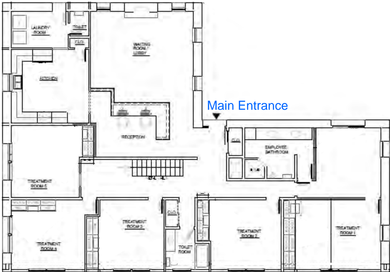
PROPOSED FLOOR PLAN - 2ND. FLOOR.