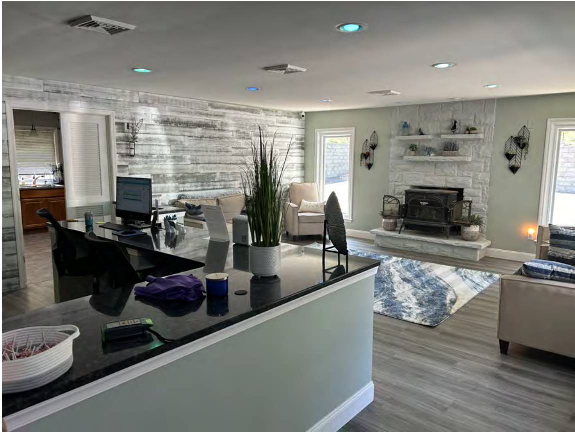
Reception and Waiting Room