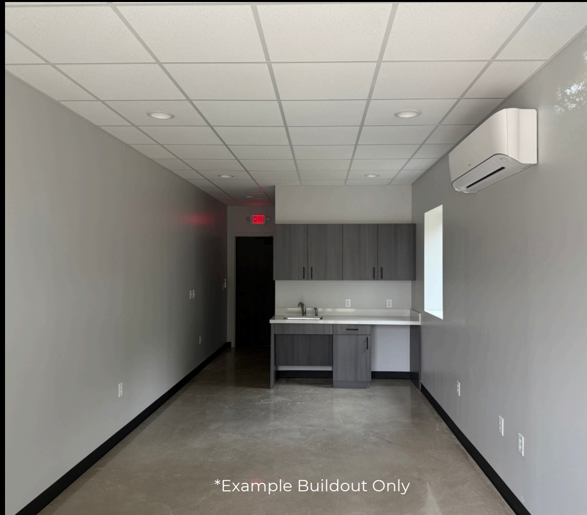
*Example Buildout Only