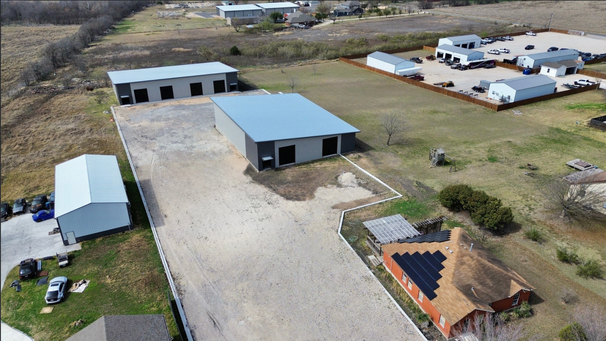
*Driveway & Parking to be finished