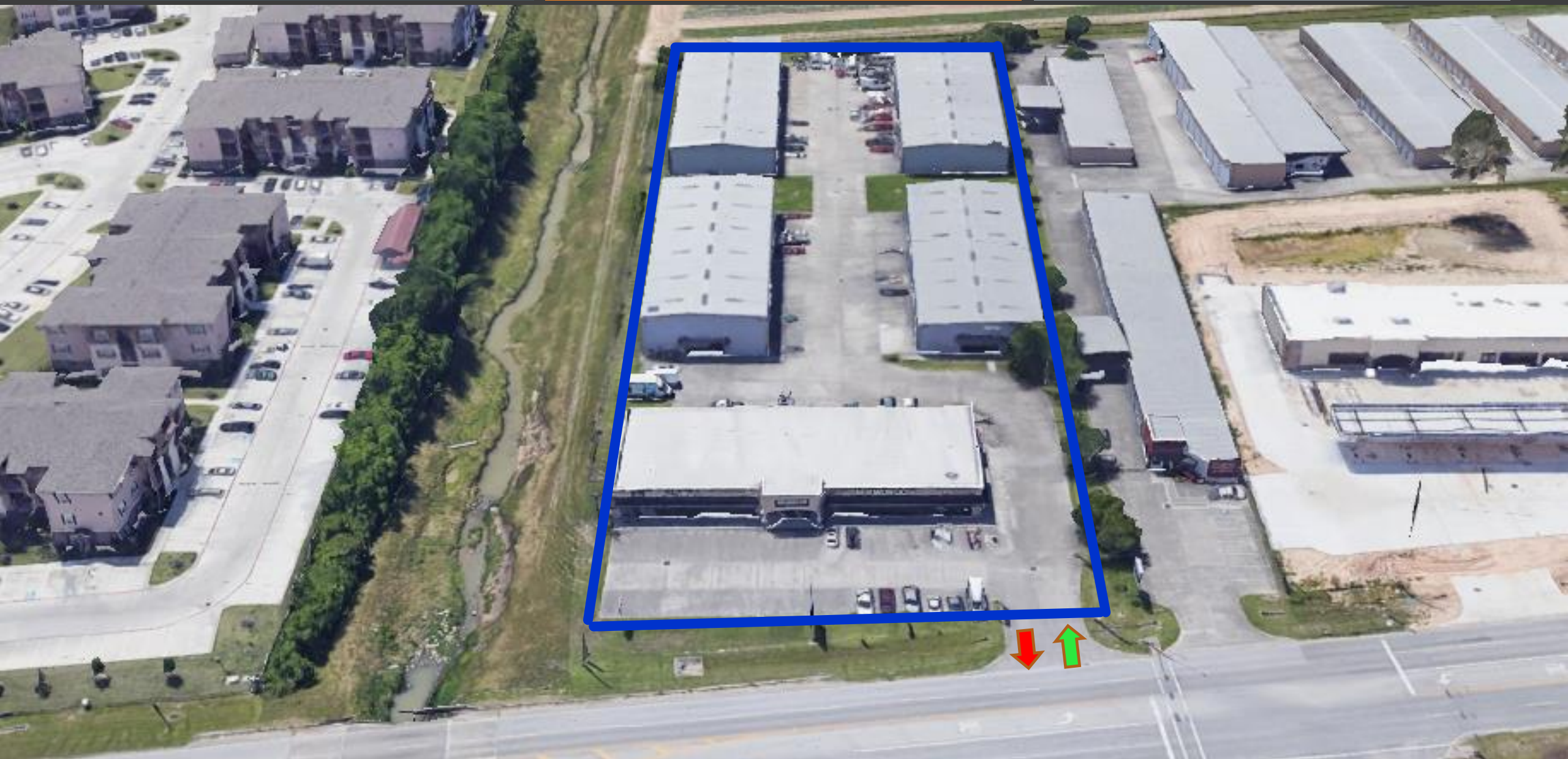
Property facing south. Only 1 mile to I-45.