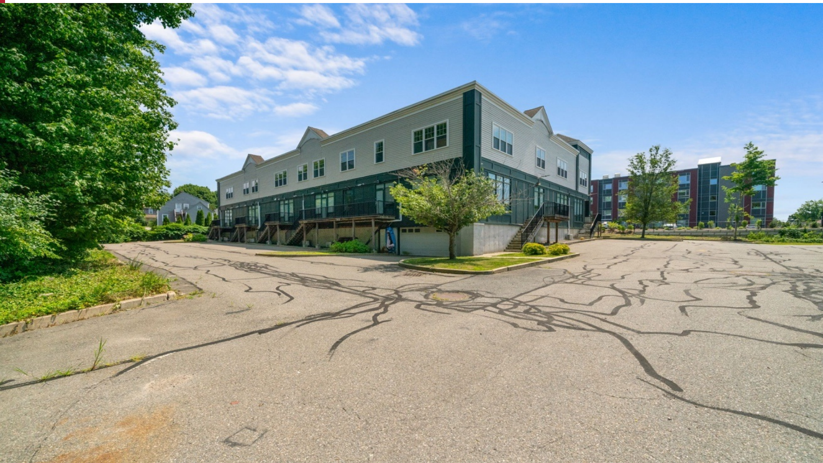
140 N. Franklin Street — Building Exterior, Holbrook MA

Holbrook serves as an established commercial hub with a diverse tenant and customer base, supported by stable demographics and strong infrastructure. The combination of highway proximity, NNN lease structures, and limited comparable supply underpins a durable demand profile at 140 North Franklin Street.