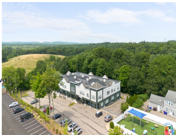
Drone Aerial — 140 N. Franklin Street, Holbrook MA