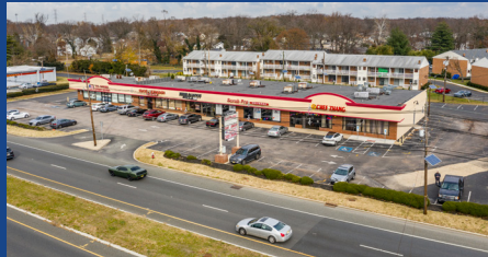
140-150 ROUTE 73 NORTH