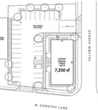
SITE PLAN (2-STORY)