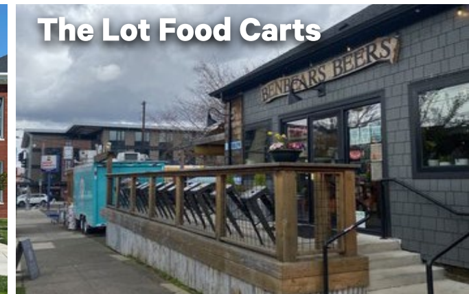
The Lot Food Carts