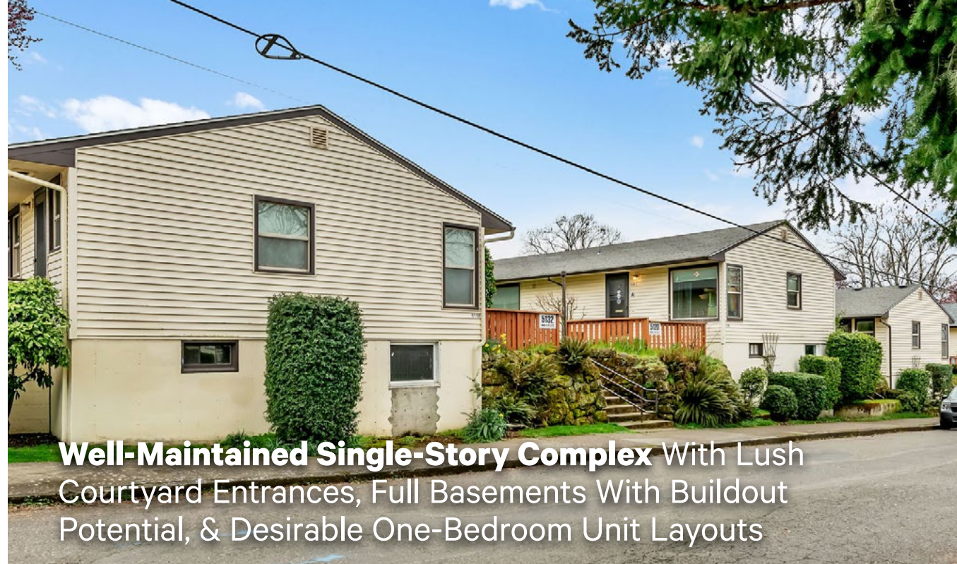
Well-Maintained Single-Story Complex With Lush Courtyard Entrances, Full Basements With Buildout Potential, & Desirable One-Bedroom Unit Layouts

Current rents are 11% below market rates