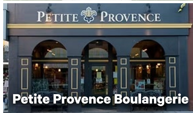
Petite Provence Boulangerie