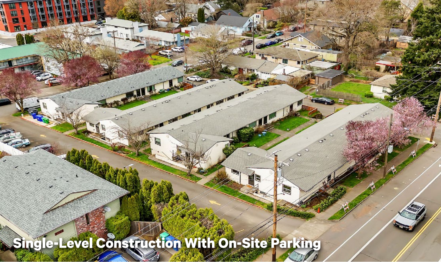
Single-Level Construction With On-Site Parking