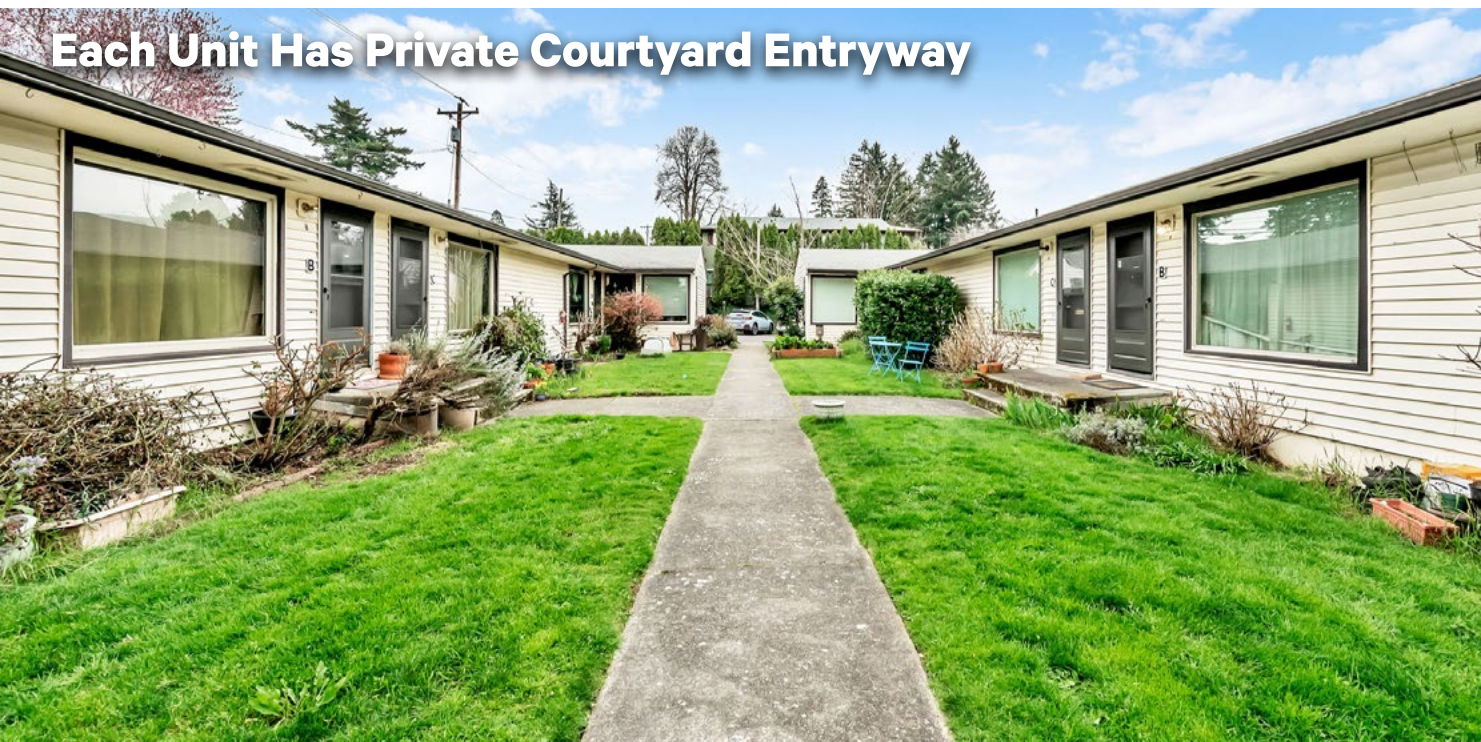
Each Unit Has Private Courtyard Entryway