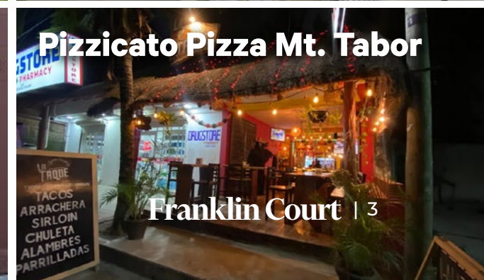
Pizzicato Pizza Mt. Tabor