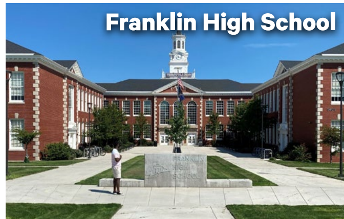
Franklin High School