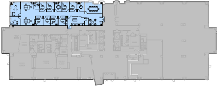
BUILDING KEY PLAN