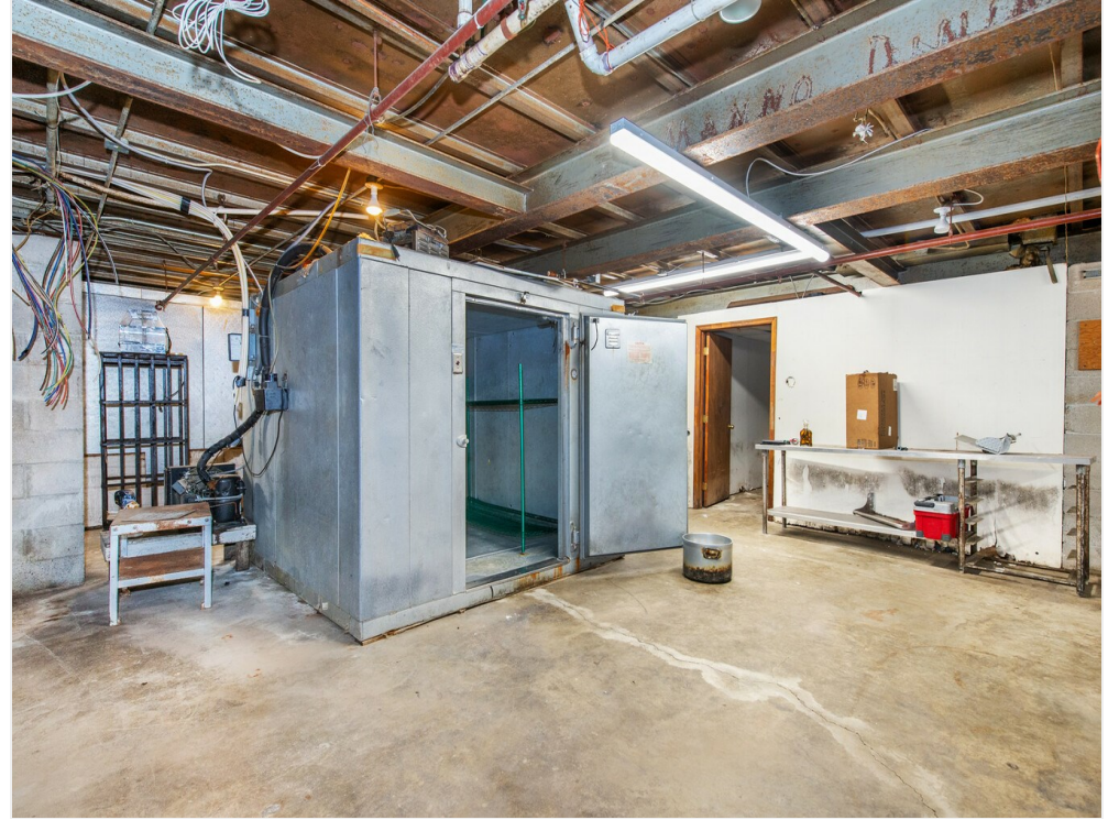
Basement Walk In