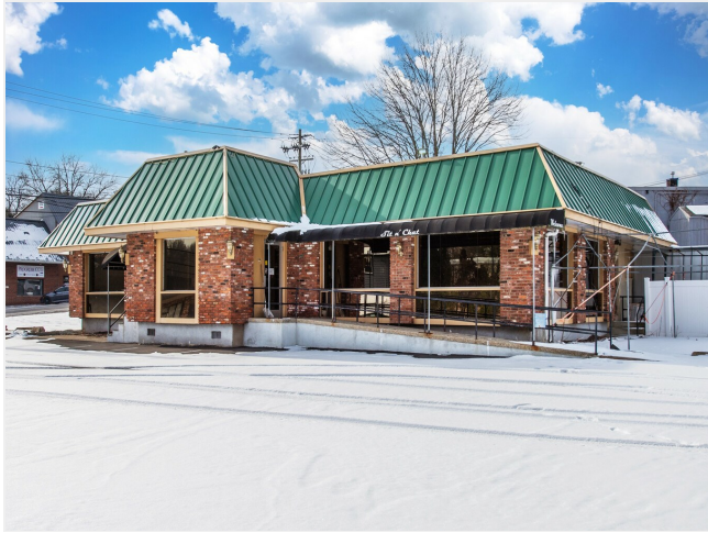
Outside Looks SW