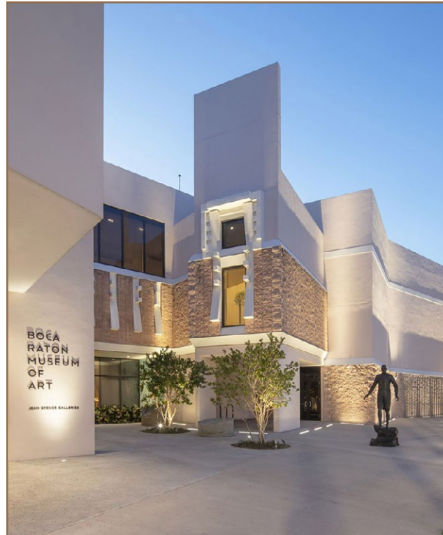
Boca Raton Museum of Art