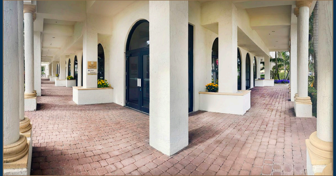
Wrap-around covered loggia with seating areas