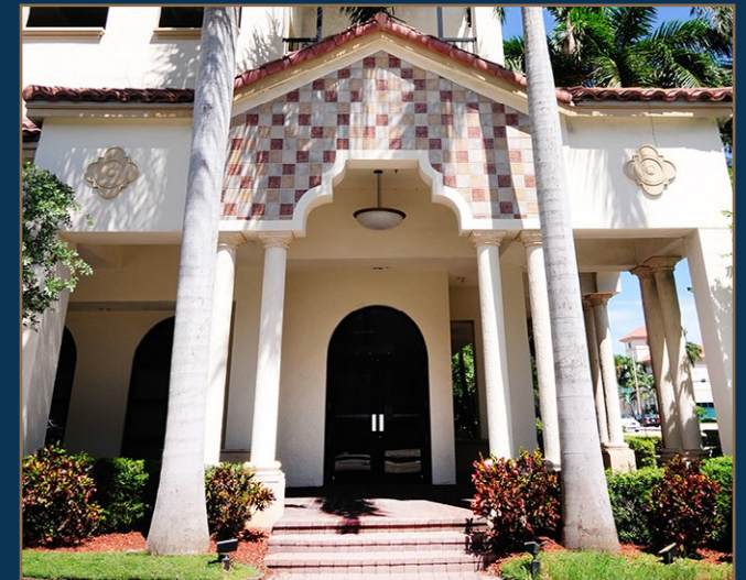
Entrance along main corridor