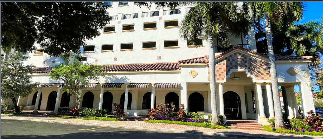
Storefront visibility extends 140 linear feet within a covered wrap-around loggia