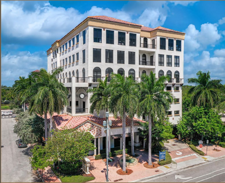
Building & monument signage visible from main corridors