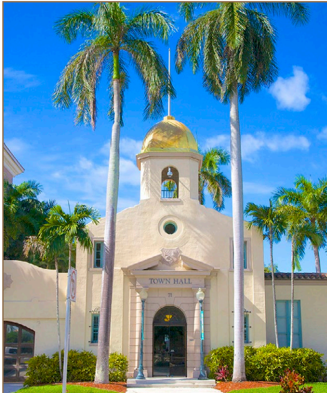
Old Town Hall, Visitor's Center and Boca Raton Historical Society Museum

An active traffic volume of approximately 50,000 cars per day. Easily accessible from all major South Florida thoroughfares, 101 Renaissance Centre is within walking distance to the new Brightline Boca Raton station (high-speed rail - Miami to Orlando), Boca Raton's Old Town Hall, and Boca Raton Museum of Art.