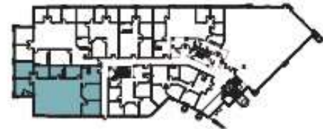
First Floor | Suite 150