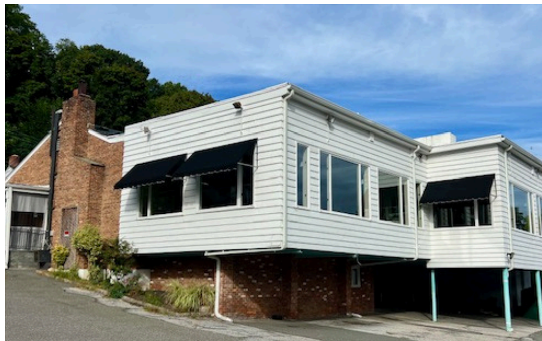
View of Building from Parking Lot