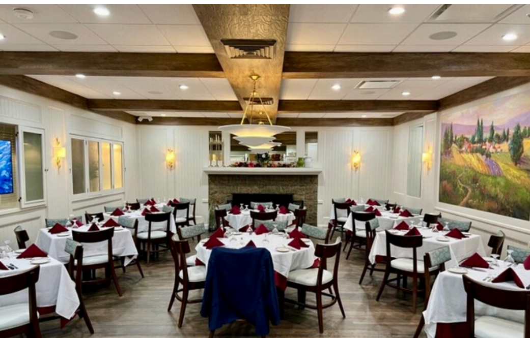
Dining Room 2