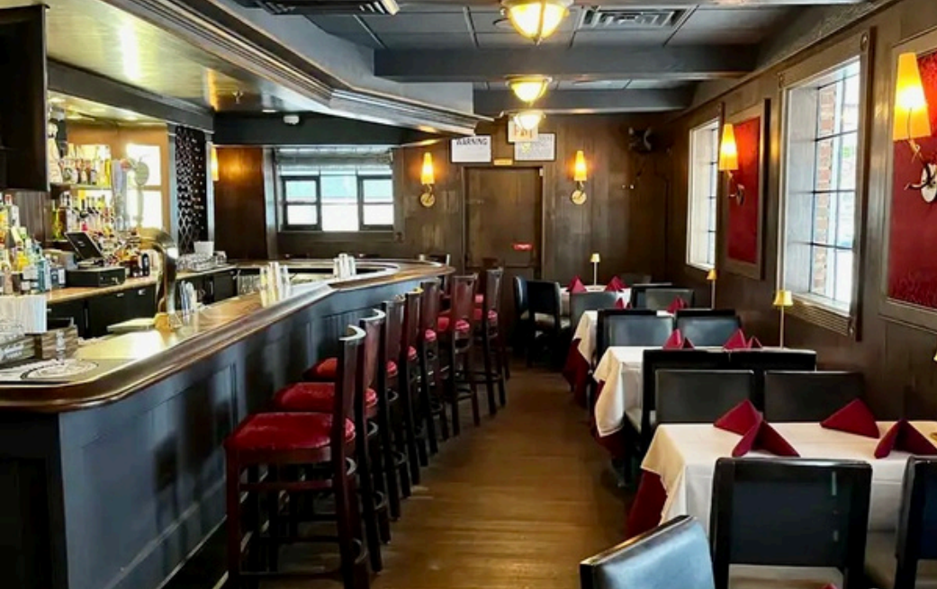
Bar / Lounge