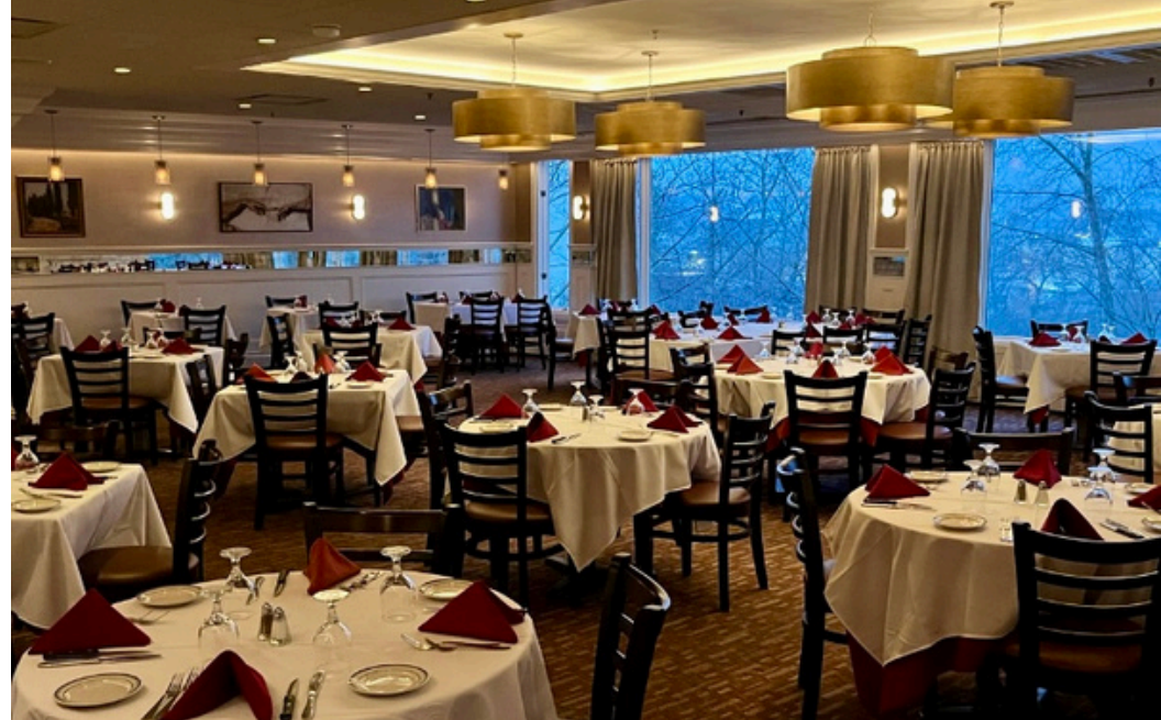
Dining Room 1