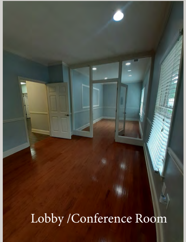
Lobby /Conference Room