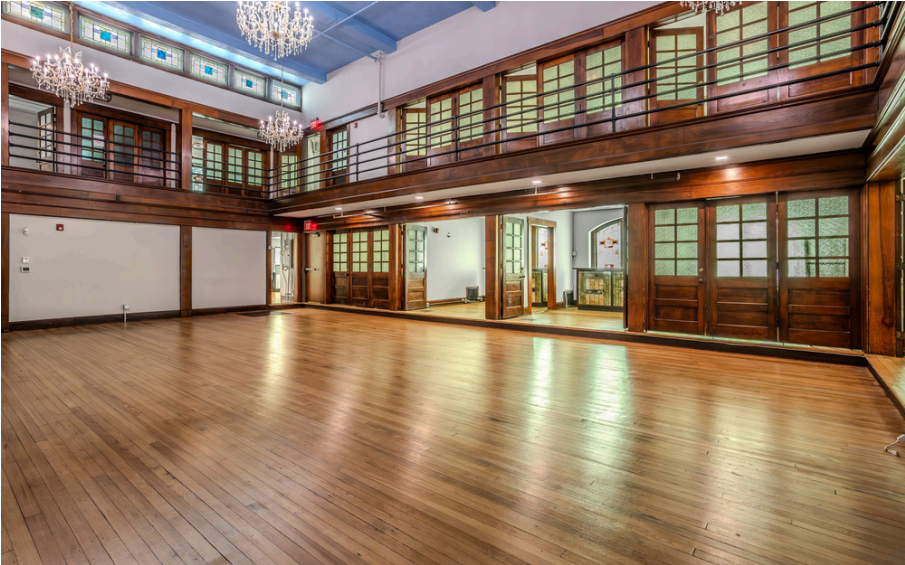
Professional dance floor