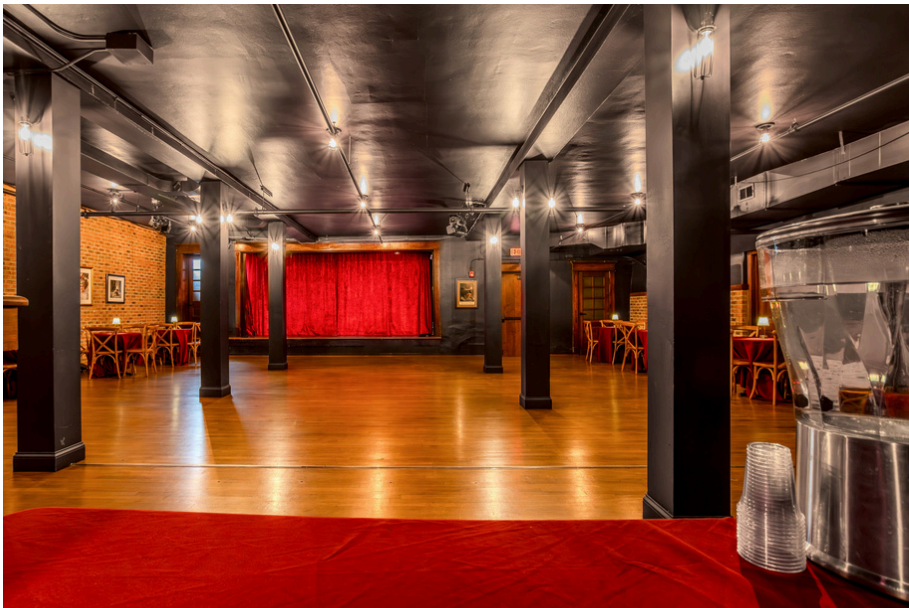
Stage area in lower level speakeasy