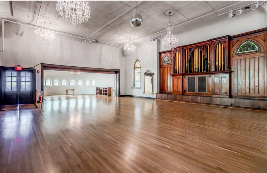
Professional dance floor