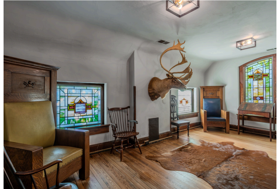
Second floor mezzanine with several prep areas