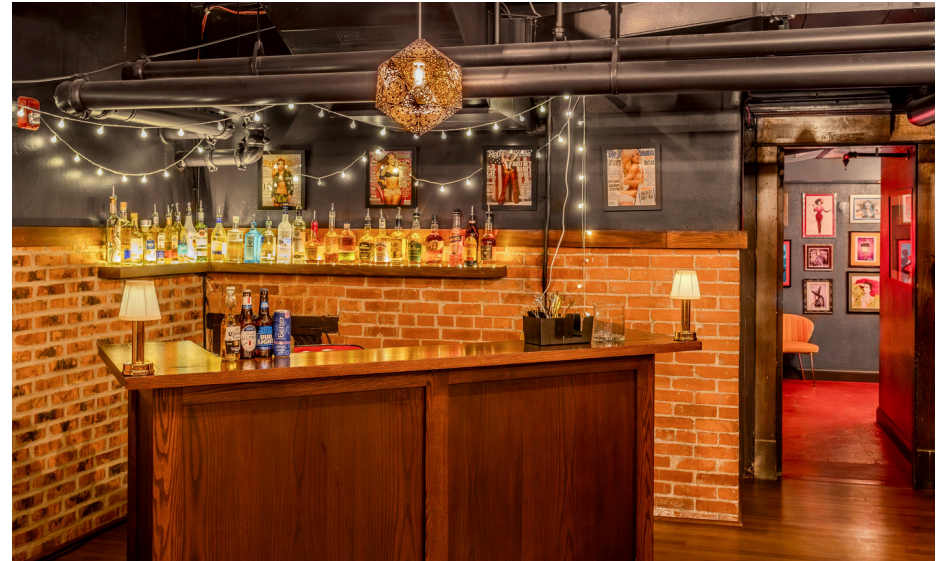
Lower level cocktail area with bar space and cocktail tables