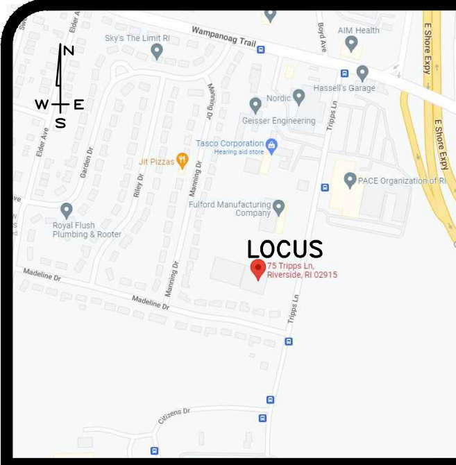
LOCUS MAP N.T.S.