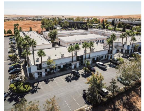
Palms Commerce Center