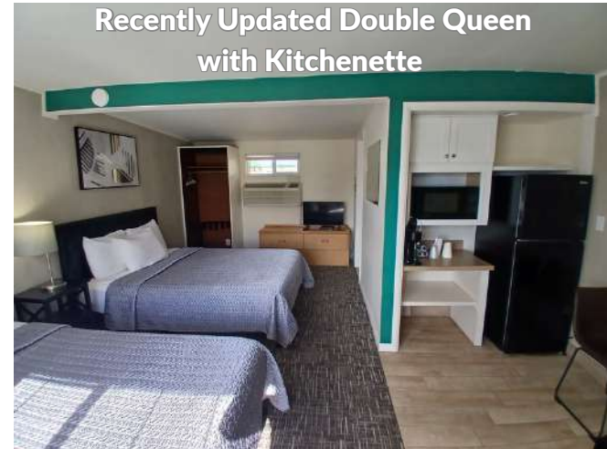
Recently Updated Double Queen with Kitchenette