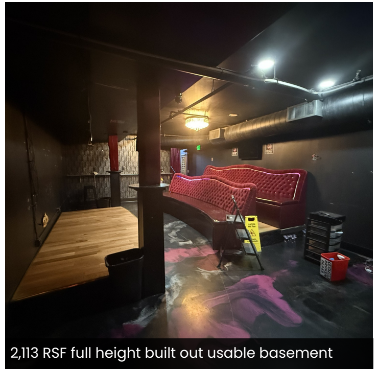
2,113 RSF full height built out usable basement