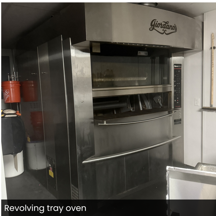
Revolving tray oven