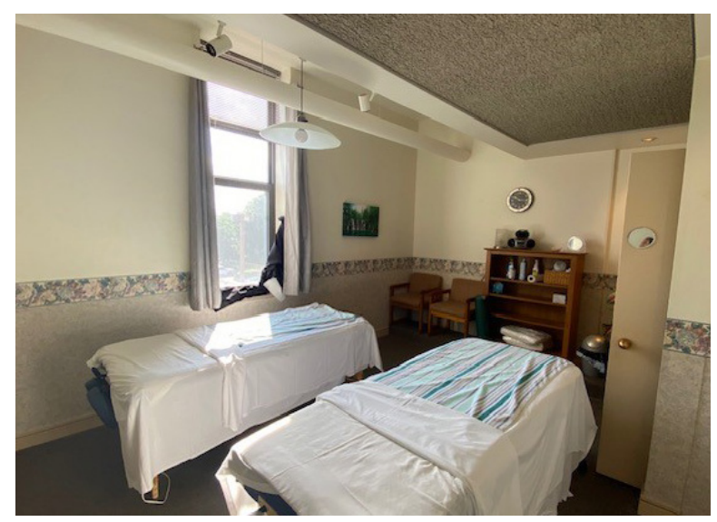
The information contained herein was obtained from sources believed to be reliable. We cannot be responsible for errors, omissions, prior sale or lease, change of price or withdrawal from the market without notice. No liability of any kind is to be imposed on the broker herein.