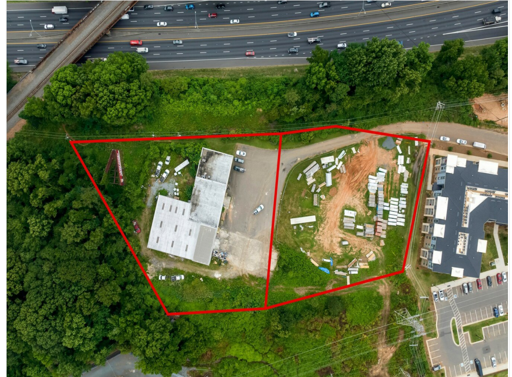
5301 Nations Crossing Rd_drone-06 outlined (1)