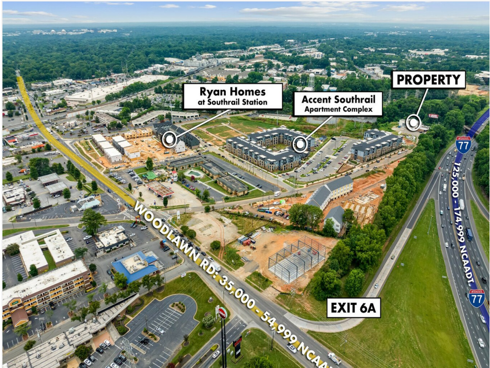
5301 Nations Crossing Rd_drone-20 outlined (003)