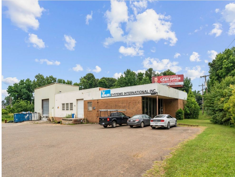
5301 Nations Crossing Rd_Ext-13