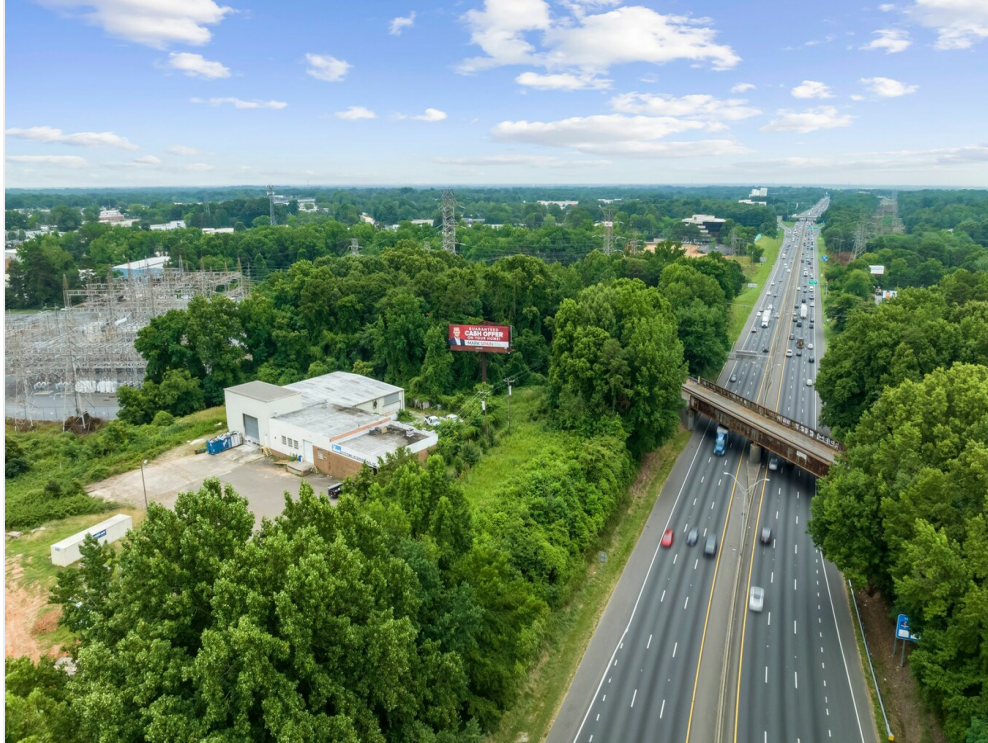
5301 Nations Crossing Rd_drone-13