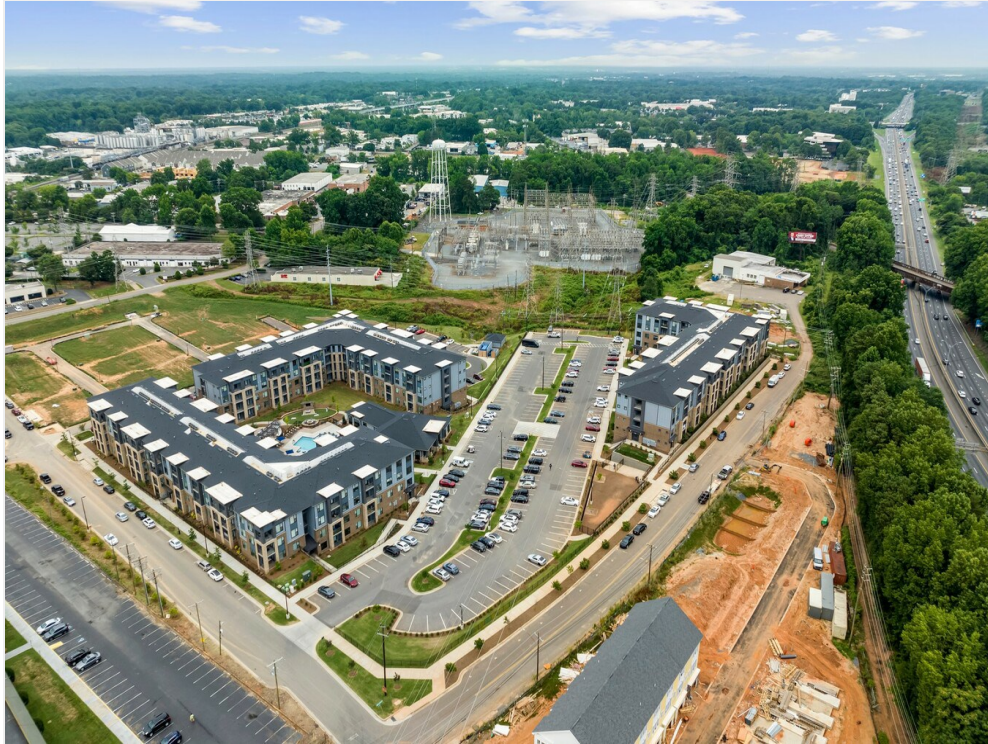
5301 Nations Crossing Rd_drone-21