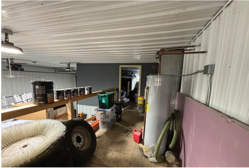
Suite 105 with mezzanine